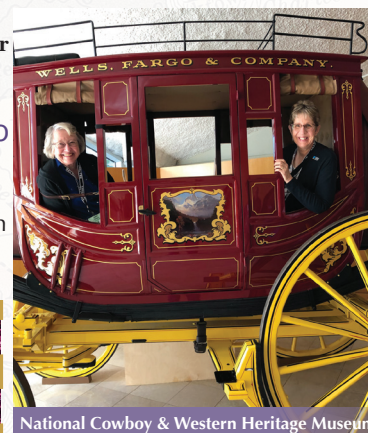
National Cowboy & Western Heritage Museum