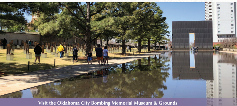
Visit the Oklahoma City Bombing Memorial Museum & Grounds