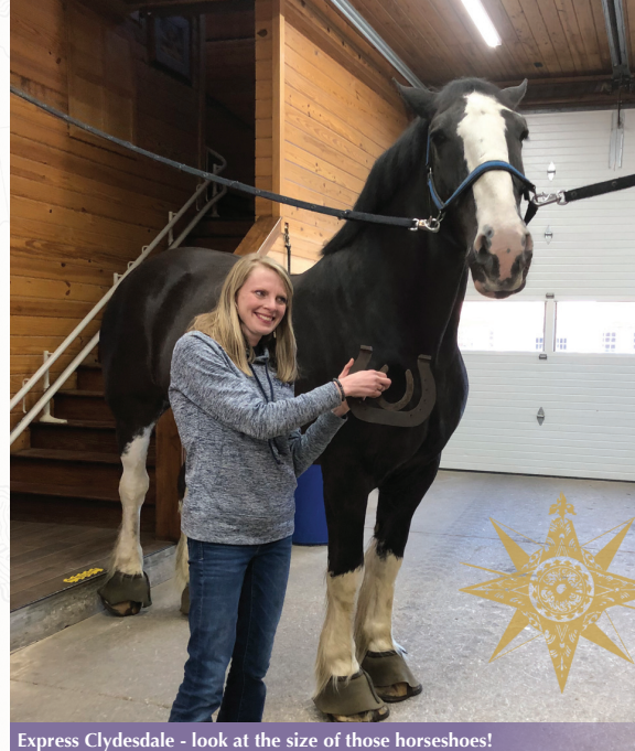
Express Clydesdale - look at the size of those horseshoes!