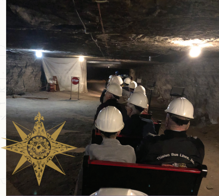
Journeying through Strataca - here we go!