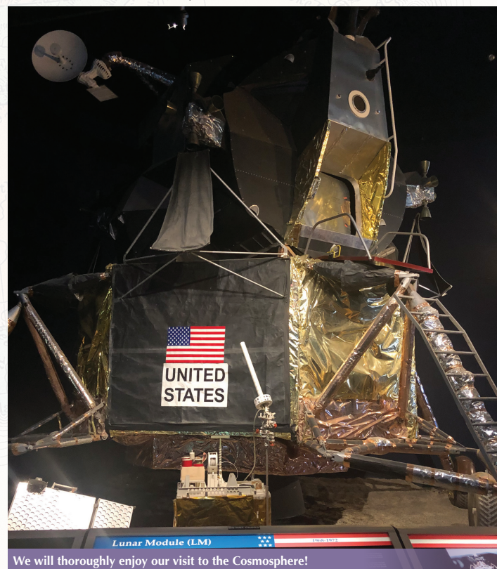
Lunar Module (LM) We will thoroughly enjoy our visit to the Cosmosphere!