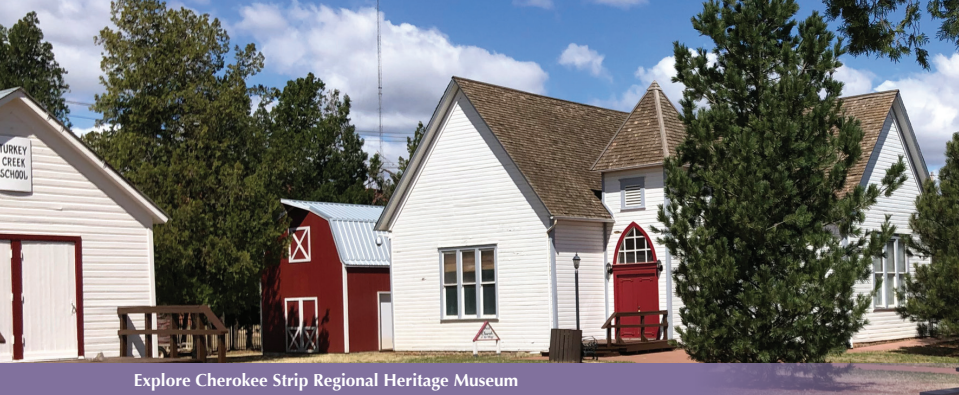
Explore Cherokee Strip Regional Heritage Museum