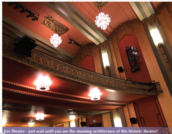
Fox Theatre - just wait until you see the stunning architecture of this historic theatre!