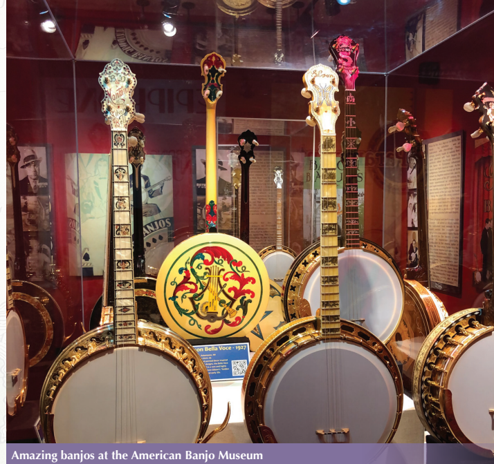
Amazing banjos at the American Banjo Museum