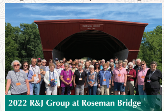
2022 R&J Group at Roseman Bridge