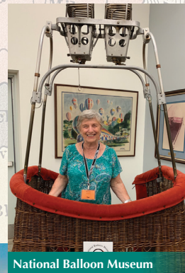
National Balloon Museum