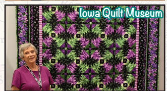
Iowa Quilt Museum