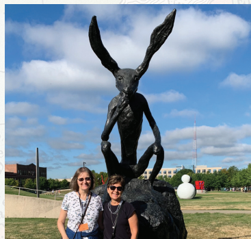
Poppajohn Sculpture Park