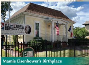
Mamie Eisenhower's Birthplace