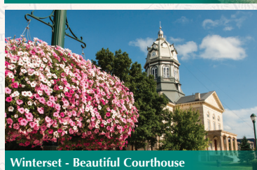
Winterset - Beautiful Courthouse