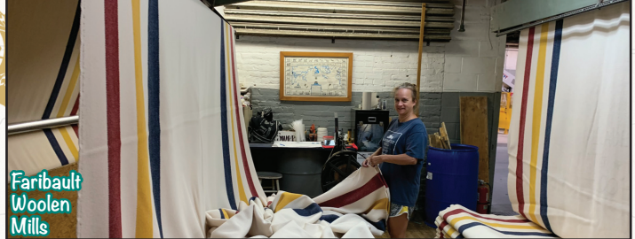
Faribault Woolen Mills

For our adventuresome early risers, roll out of bed very early, and head to the Memorial Balloon Field. Prepare to be awestruck as dark skies come alive with a mystical glow as balloons ascend the skies during Dawn Patrol. Bring your flashlight, it's still dark! Watch in wonder as the balloons launch prior to sunrise and fly until it's light enough to land. Secured with specially approved lighting systems, balloons flying in the dark are a rare phenomenon in ballooning. We don't want to be late or we'll miss it! If you purchased an optional balloon ride, you'll be among the riders in the early morning sky! (Individuals are responsible for the cost and liability.) We'll get back to the hotel in time to enjoy a relaxing hot breakfast buffet. We've earned it. Later this morning we will check out the National Balloon Museum and Ballooning Hall of Fame. This is an included, don't miss, opportunity for us to tour & explore Hot Air Ballooning and its rich history through amazing and colorful exhibits. We'll enjoy an included lunch together then head to Summerset Winery for a tour and wine tasting. We'll