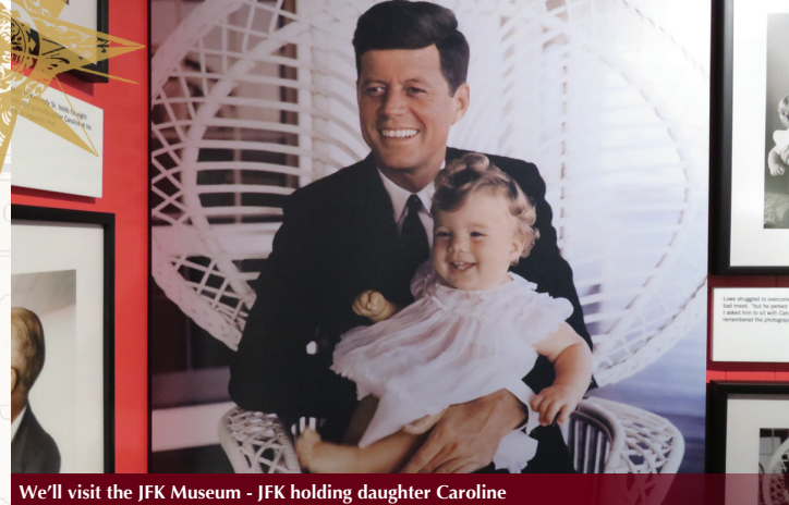
We'll visit the JFK Museum - JFK holding daughter Caroline