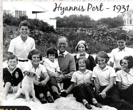
Kennedy Family (JFK top left)