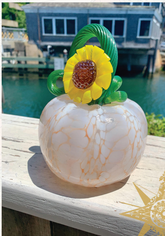
Sandwich Glass Museum - this is 2022's Pumpkin of the Year!