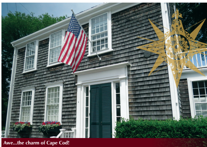
Awe...the charm of Cape Cod!