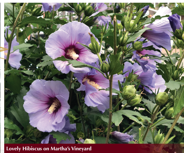
Lovely Hibiscus on Martha's Vineyard

cans and people of other nations and cultures by sending volunteers from the U.S. to work in developing countries. This memorial commemorates the 50th anniversary of the creation of the Peace Corps. Then we visit the oldest town on Cape Cod, Sandwich. We'll view the Village Green, the Great Salt Marsh, a cranberry bog, and Cape Cod Bay. This quaint and quiet seaside community is the hometown of Thornton Burgess, naturalist & author of 170 children's books. At the Sandwich Glass Museum we will view sparkling exhibits that describe the transformation of a small farming community into one of the most respected manufacturers & one of America's largest glass factories in the 19th century. We'll watch as molten glass is drawn from the furnace, blown, and pressed into exquisite shapes. Dinner is included this evening at the historic Dan'l Webster Inn.