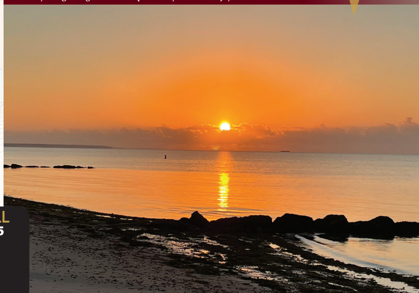
We'll stay 5 nights right on the Cape's sandy shore & enjoy the sunsets!