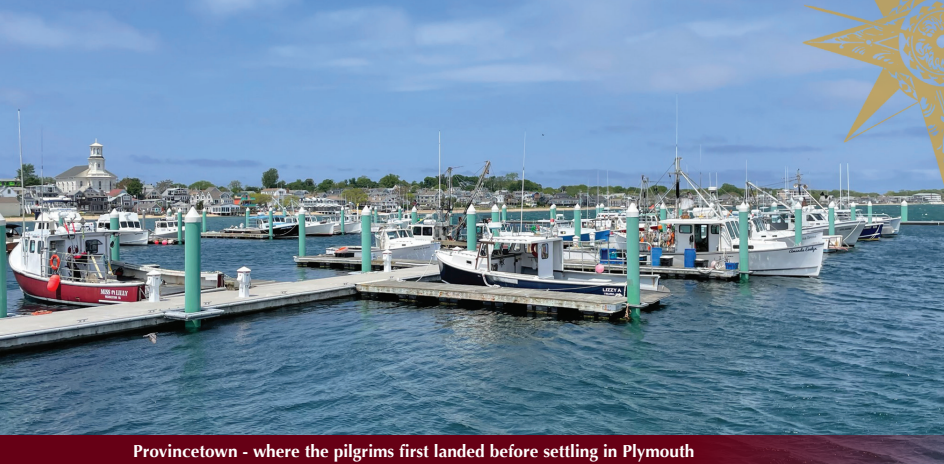
Provincetown - where the pilgrims first landed before settling in Plymouth