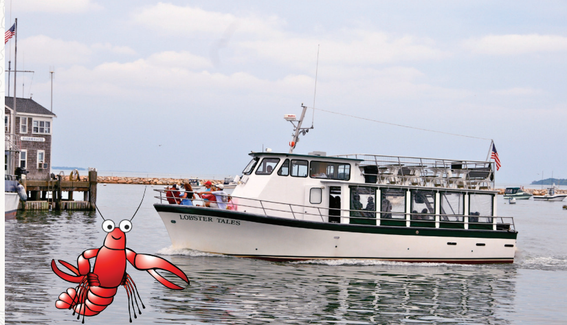
Set sail on a Lobster Tales Cruise - we'll roll up our sleeves & help haul in the traps!