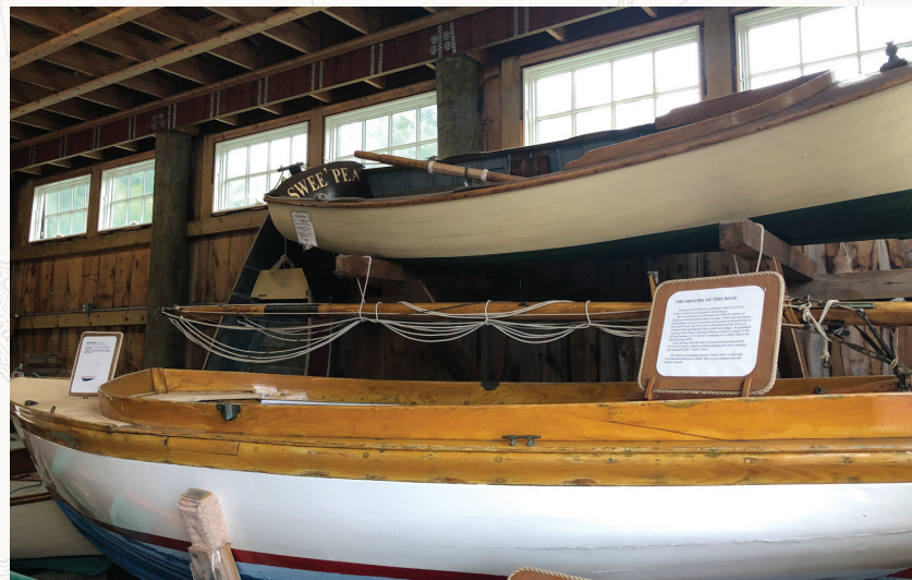
Interesting history awaits at the Cape Cod Maritime Museum