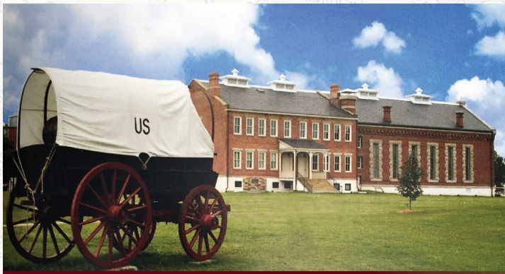
Fort Smith Historic Site - home to countless stories of American history!