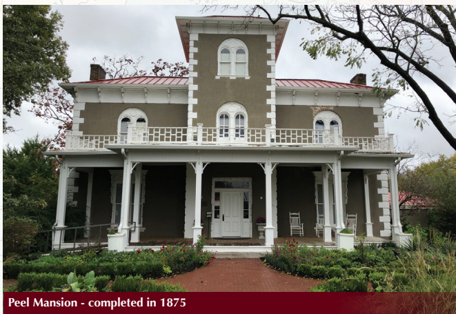
Peel Mansion - completed in 1875