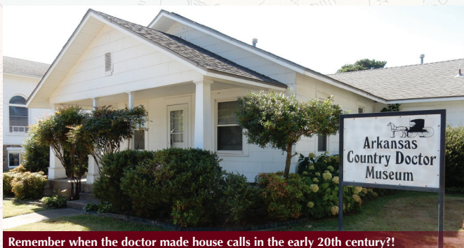
Remember when the doctor made house calls in the early 20th century?!