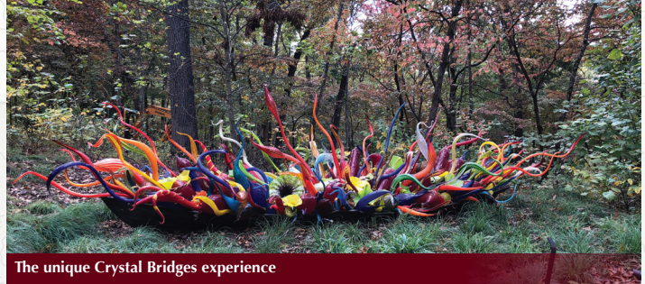
The unique Crystal Bridges experience

and fresh baked goods to take home with you. You are on your own this evening for dinner.