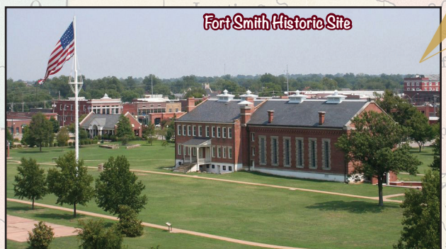
Fort Smith Historic Site