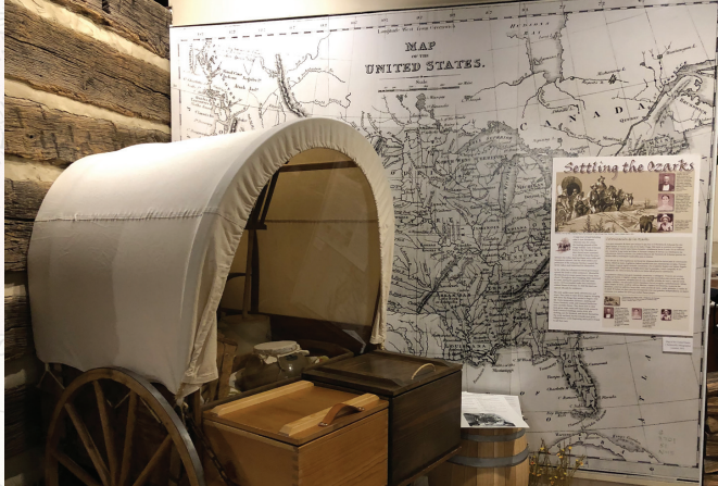
Explore the Shiloh Museum of the Ozarks