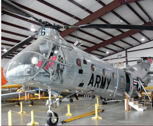
Arkansas Air & Military Museum - most of the aircraft we'll see still fly!