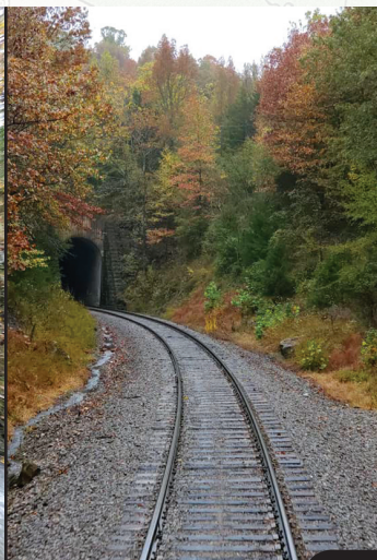
Scenic A&M Railroad ride