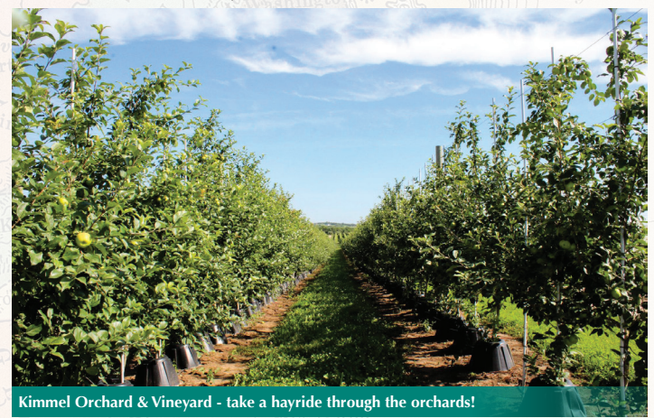
*Pick-up locations will be decided at a later date.*