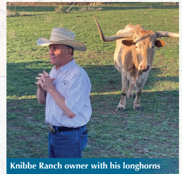
Knibbe Ranch owner with his longhorns