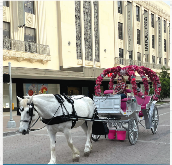
Your carriage awaits in San Antonio!