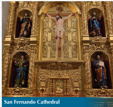
San Fernando Cathedral