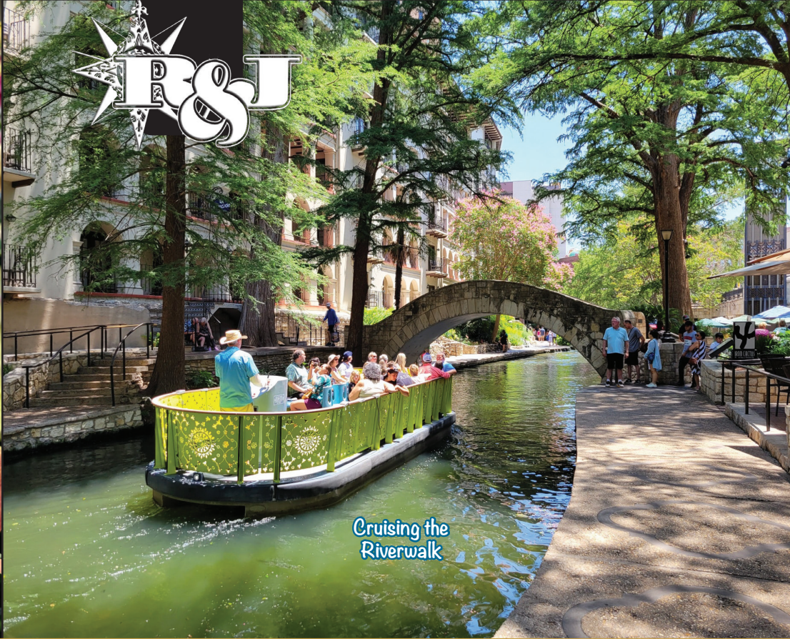
Cruising the Riverwalk