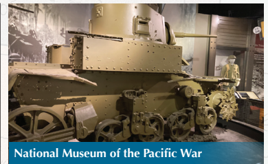
National Museum of the Pacific War