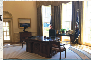
Bush's replica Oval Office