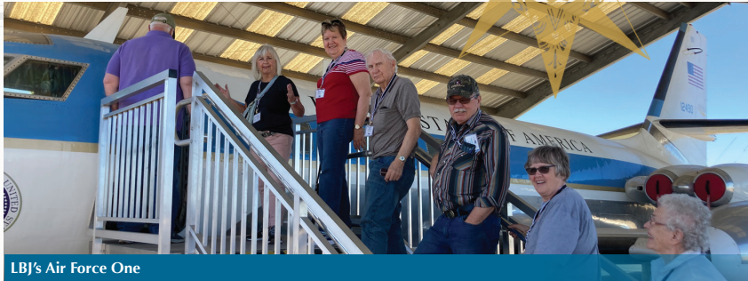
LBJ's Air Force One