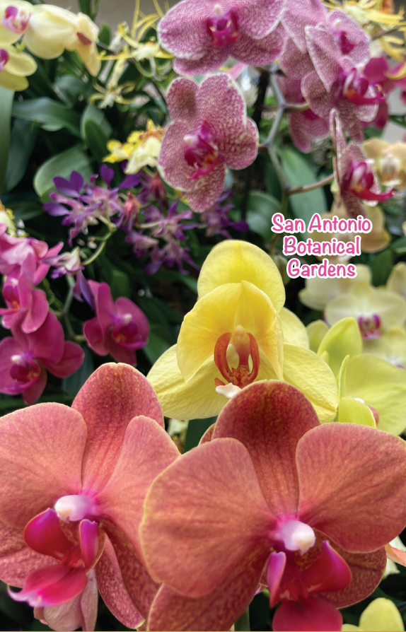
San Antonio Botanical Gardens