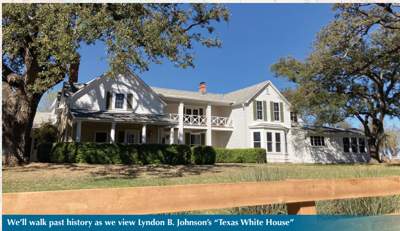
We'll walk past history as we view Lyndon B. Johnson's "Texas White House"