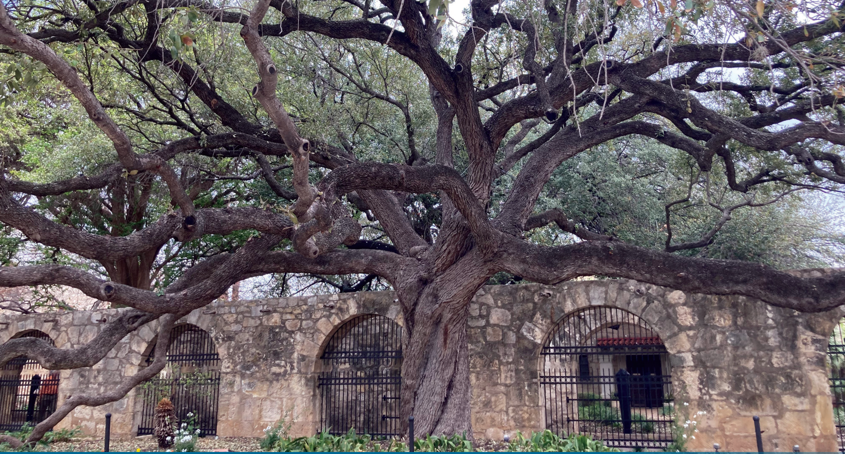
Take in the beauty and history at The Alamo - The Cradle of Texas Liberty