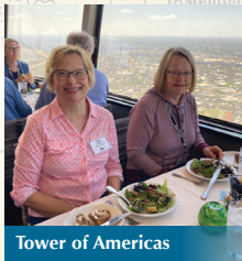
Tower of Americas