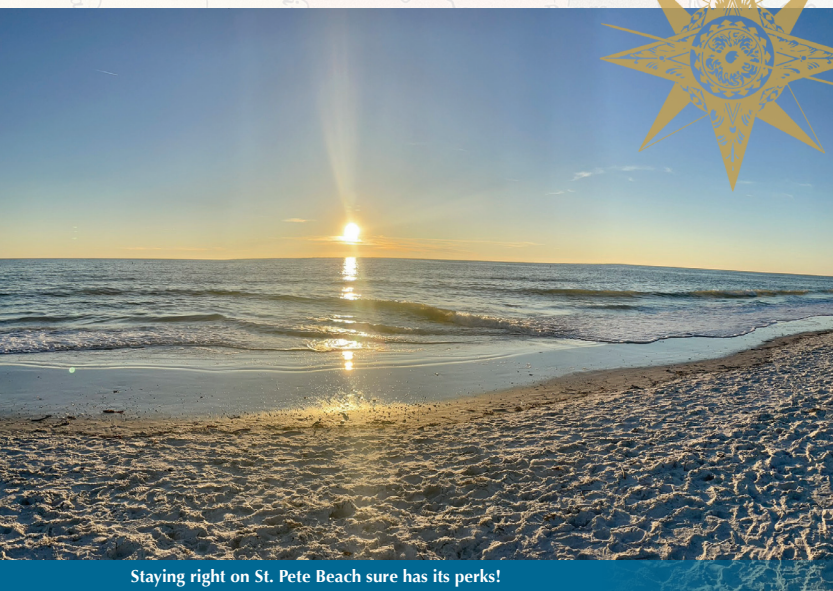
Staying right on St. Pete Beach sure has its perks!

Enjoy Outside Cabins with a Balcony aboard the Liberty of the Seas!