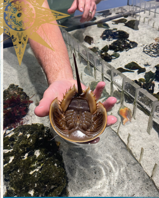
Tampa Bay Watch Discovery Center