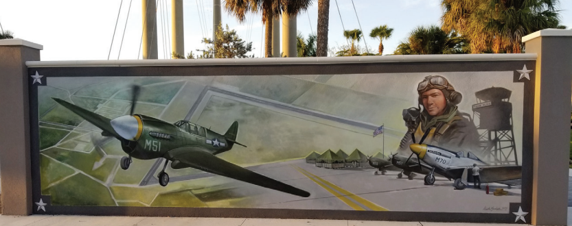
We'll explore Punta Gorda's murals with the help of a local guide