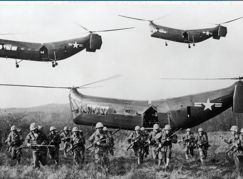
Visit the Military Heritage Museum - their purpose is to honor all who serve