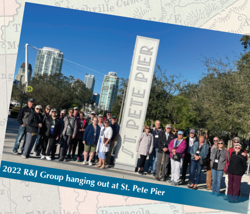
2022 R&J Group hanging out at St. Pete Pier