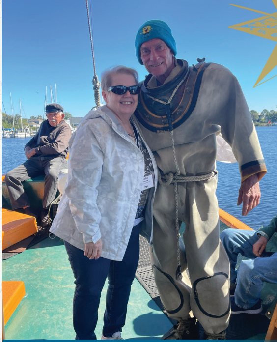
Experience a sponge diving demonstration in Tarpon Springs!