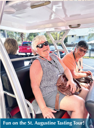
Fun on the St. Augustine Tasting Tour!