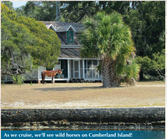
As we cruise, we'll see wild horses on Cumberland Island!