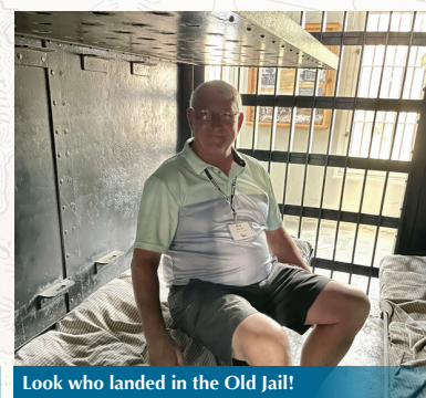
Look who landed in the Old Jail!