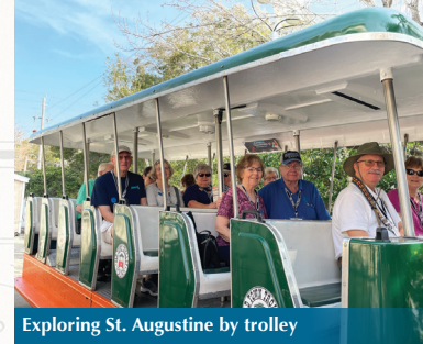
Exploring St. Augustine by trolley