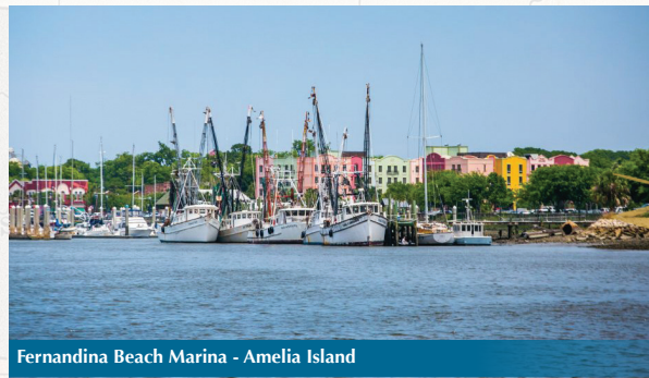
Fernandina Beach Marina - Amelia Island