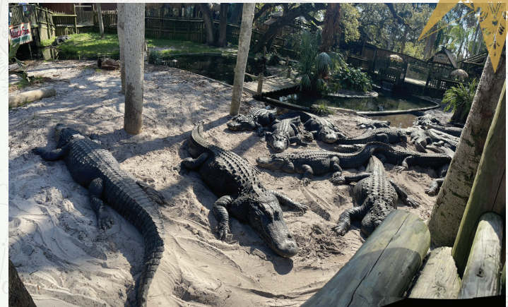
St. Augustine Alligator Farm Zoological Park