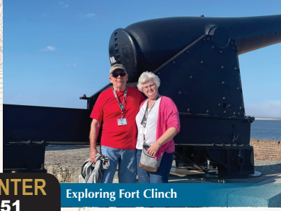
Exploring Fort Clinch