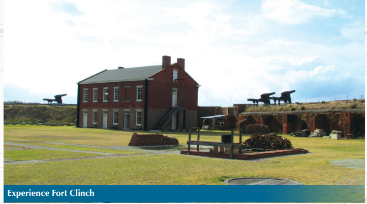
Experience Fort Clinch

After we enjoy our breakfast, we will make our way to the Lightner Museum. Occupying the former Hotel Alcazar, a Gilded Age resort hotel commissioned by railroad magnate Henry Flagler, the Lightner Museum offers an immersive experience of art, architecture, history, and design. Then, be sure to have your walking shoes on! A local guide is going to tell us all about the city's