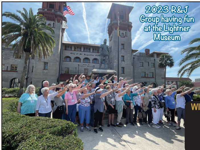
2023 R&J Group having fun at the Lightner Museum