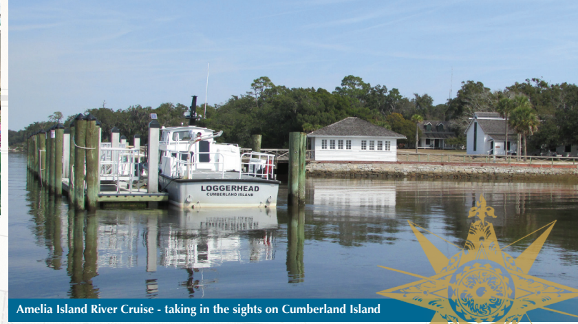
Amelia Island River Cruise - taking in the sights on Cumberland Island