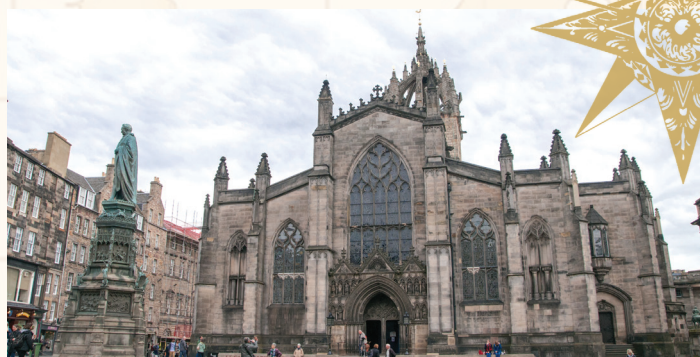
St. Giles Cathedral - Edinburgh