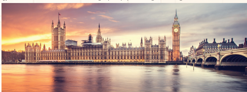
London - Palace of Westminster and Big Ben (the iconic national timepiece) overlooking River Thames

After breakfast we'll travel through Snowdonia National Park (subject to availability), which holds the highest mountain in England and Wales. We'll also enjoy Conwy, one of Europe's finest surviving medieval towns. The Conwy Castle, built between 1283- 1289, dominates the town and was Edward I's most striking and powerful castle. We'll thoroughly enjoy touring this magnificent fortress as