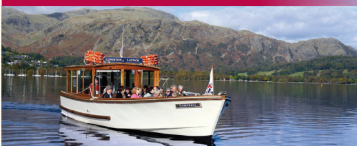
Coniston Lake Cruise