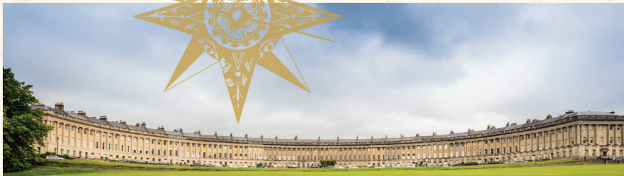
The Royal Crescent in Bath - row of 30 terraced houses laid out in a sweeping crescent. Built between 1767-1774