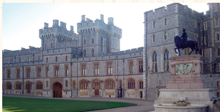
Windsor Castle - construction started in 1070!