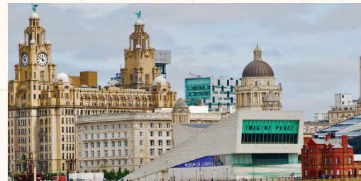
Liverpool - home of the Beatles!