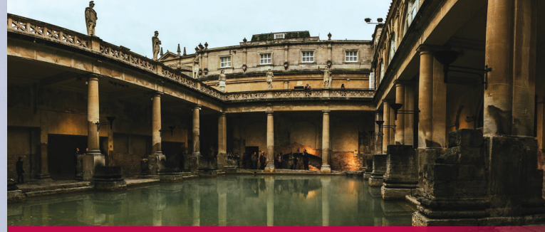
Bath - Roman Baths