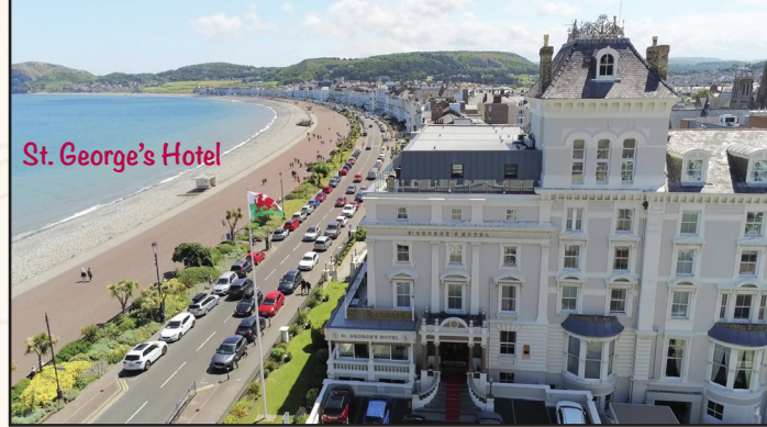
St. George's Hotel