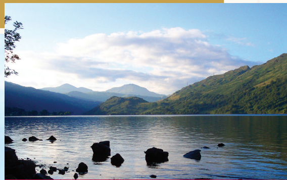
Loch Lomond - cruise through Scotland's longest loch!