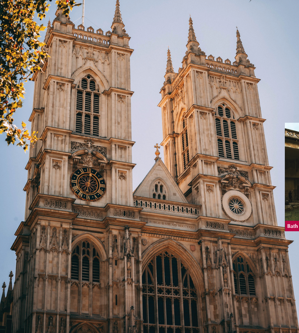
Westminster Abbey - since opening in 1090, all coronations of English & British monarchs have been held here