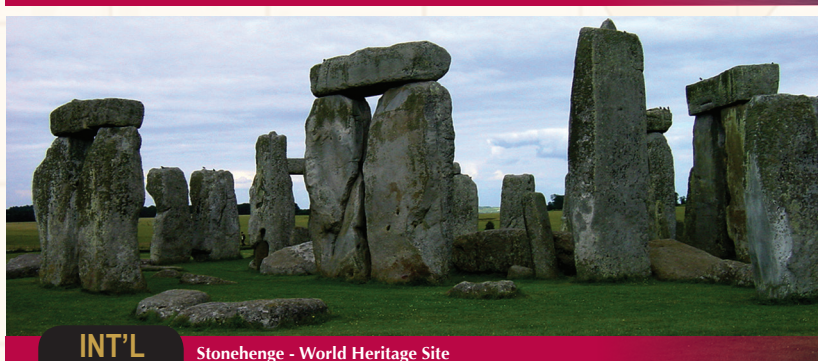
Stonehenge - World Heritage Site