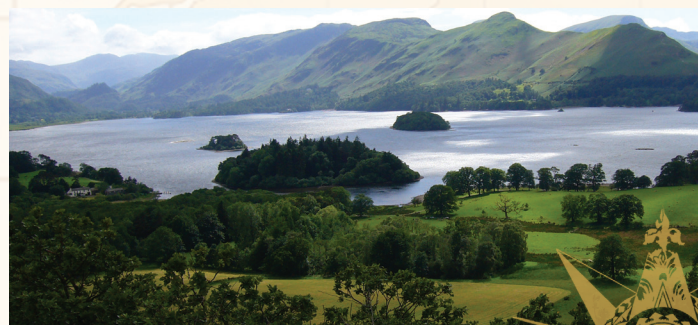
Beautiful Lake District

we climb restored spiral staircases in its great towers, allowing us to walk a complete circuit around the battlements of Conwy Castle.