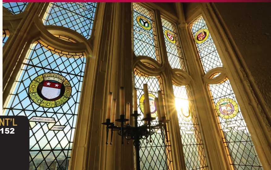
Stirling Castle - beautiful stained glass windows in the Great Hall

After breakfast, our adventure to Scotland begins. Today we pass through the village of Gretna Green as we cross the border into Scotland. Check into our 4-star hotel, perfectly located in the heart of the Scottish capital, and unpack for our 4-night stay. This evening