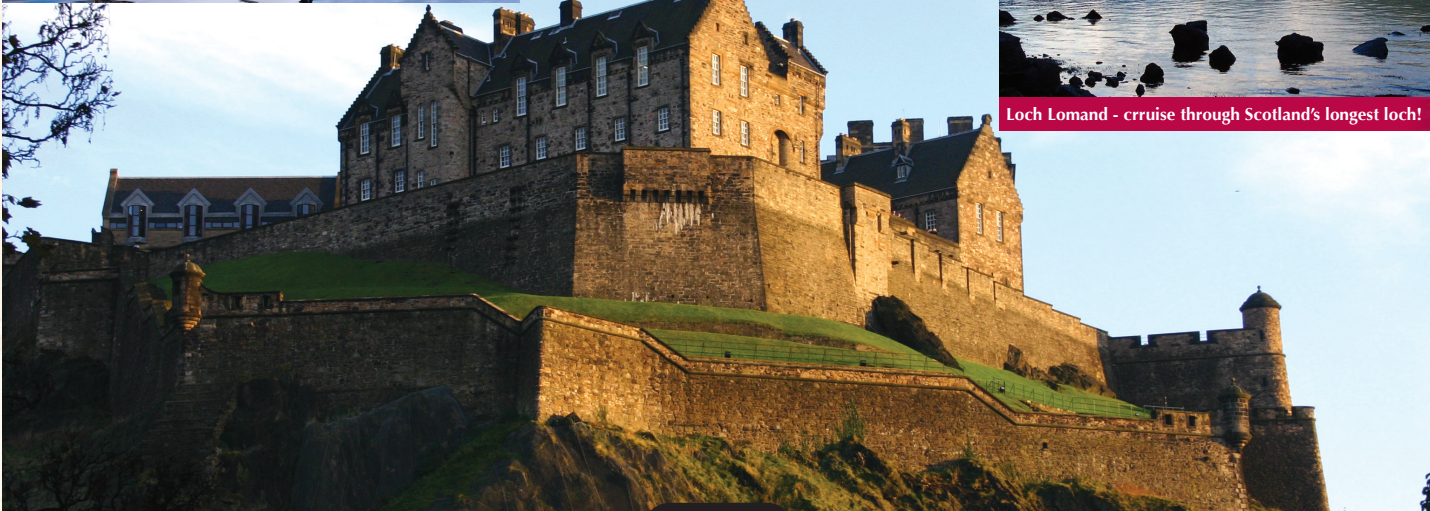
Edinburgh Castle grandly sits high above the city!