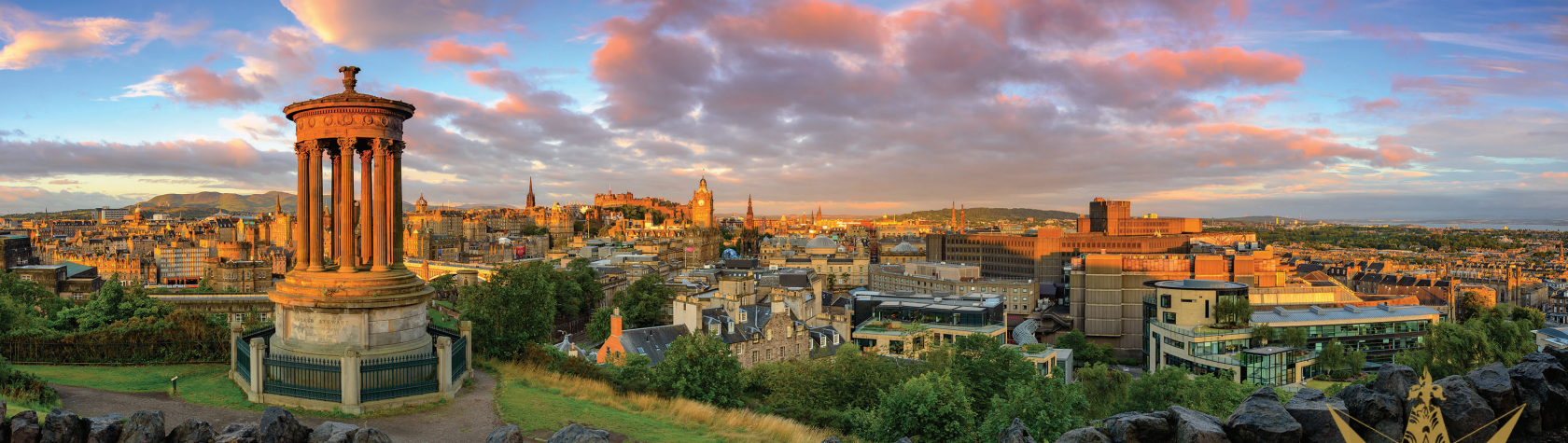
Edinburgh skyline - the compact, hilly capital of Scotland, it has a medieval Old Town & an elegant New Town with gardens and neoclassical buildings.