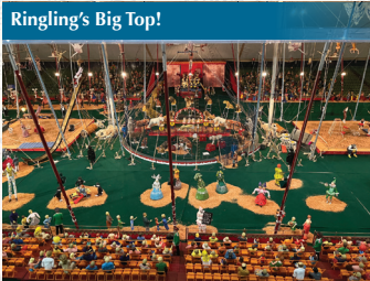
Ringling's Big Top!