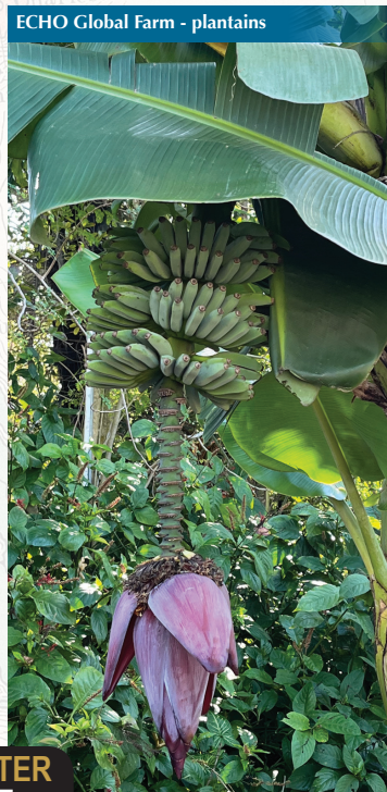
ECHO Global Farm - plantains