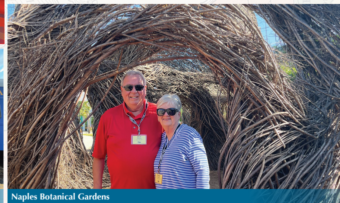
Naples Botanical Gardens

find! This evening we will be guests at the Broadway Palms Dinner Theater for dinner and a fantastic performance.