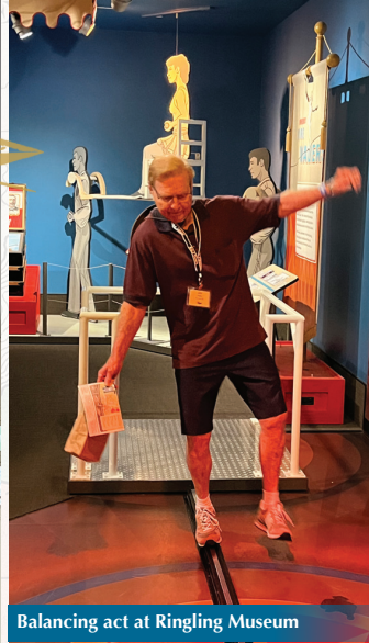
Balancing act at Ringling Museum