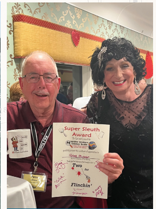
Mystery Dinner on Seminole Railway