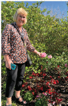
Ford & Edison Estates