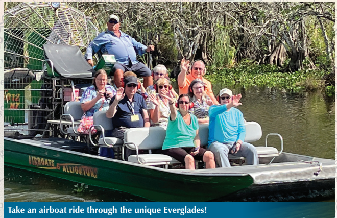
Take an airboat ride through the unique Everglades!