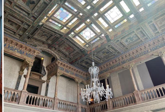
Ca'D'Zan - home of John Ringling - Mediterranean Revival style