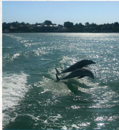
Fun dolphin experience during Naples Bay cruise!