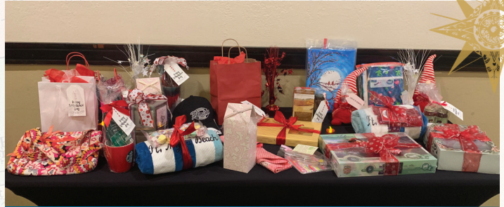
Spectacular bingo prizes were ready for 2023's Valentine's Party!

Our comfy "home away from home" - which has been carefully selected for its convenient & safe location with many dining, shopping, and entertainment options within easy walking distance.