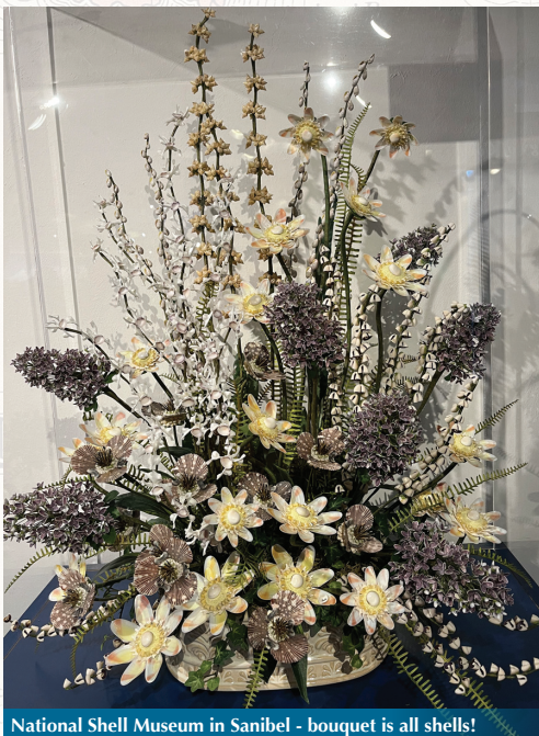
National Shell Museum in Sanibel - bouquet is all shells!