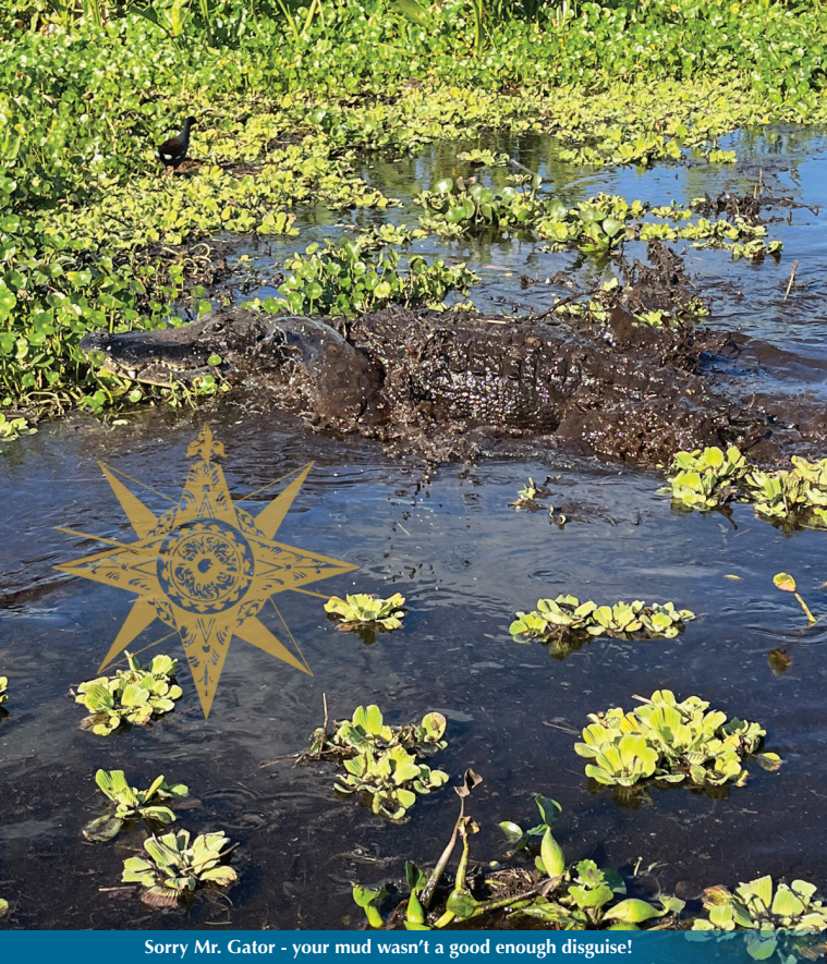
Sorry Mr. Gator - your mud wasn't a good enough disguise!