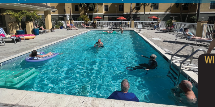
Soaking up the sun as we enjoy Homewood Suites' pool

After breakfast we will visit the amazing Edison Ford Estate for a self-guided tour of the wonderful grounds and homes. Next we will