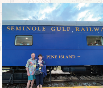
Step aboard the Seminole Gulf Railway