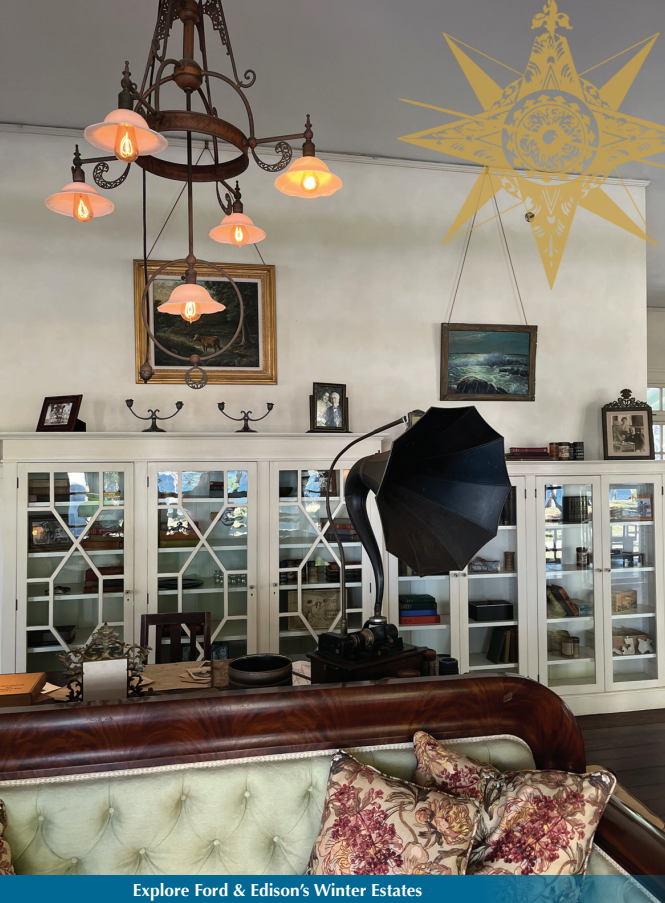
Explore Ford & Edison's Winter Estates