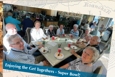
Enjoying the Get Togethers - Super Bowl!