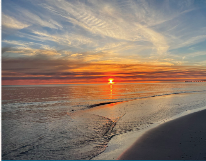
Panama City Beach produces breathtaking sunsets!

Included Meals: Breakfast Hotel: Holiday Inn & Suites