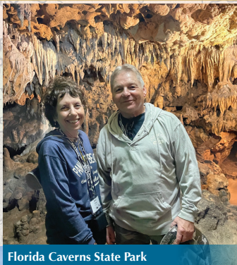
Florida Caverns State Park

* Fees for excursions are at your own cost.