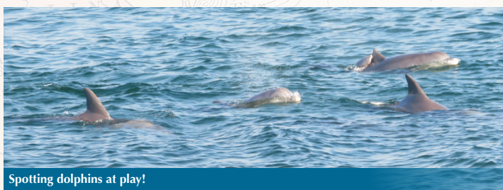
Spotting dolphins at play!