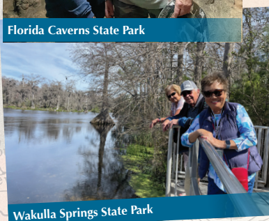
Wakulla Springs State Park