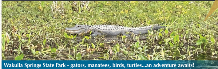
Wakulla Springs State Park - gators, manatees, birds, turtles...an adventure awaits!