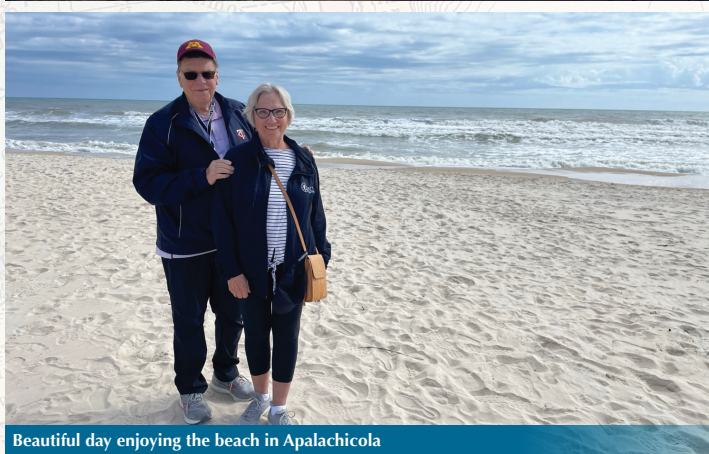
Beautiful day enjoying the beach in Apalachicola