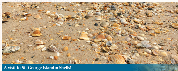
A visit to St. George Island = Shells!