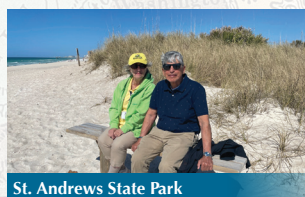
St. Andrews State Park

3 Bedroom Corner Upgrade Per Person: $600 p/p Double / $1,200 Single