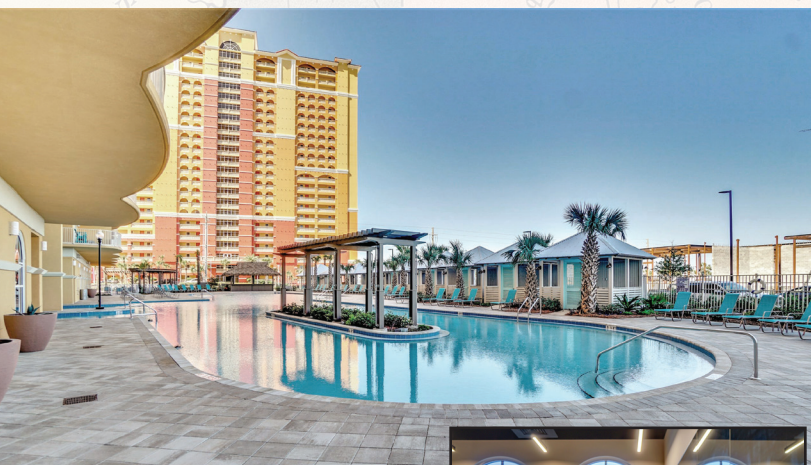
Enjoy the Calypso's amenities!

Nearby you'll also find Wal-Mart Supercenter, CVS, & Target Grocery.