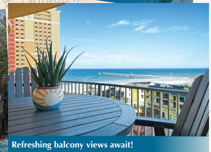
Refreshing balcony views await!