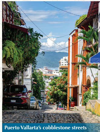
Puerto Vallarta's cobblestone streets