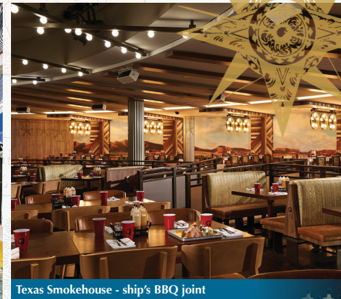
Texas Smokehouse - ship's BBQ joint