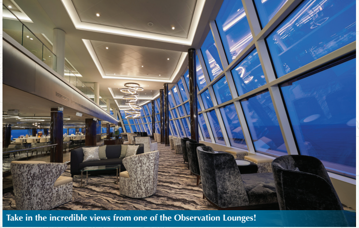
Take in the incredible views from one of the Observation Lounges!

This morning after another wonderful breakfast buffet, we will head to the USS Midway Museum. Through the self-guided audio tour of the USS Midway Naval Aircraft Carrier, the ship's story comes to life as we explore the carrier from top to bottom. Lunch is on our own today before we visit the Museum of Making Music in Carlsbad, CA. Founded in 1998 by the National Association of Music Merchants, the Museum was developed to showcase and celebrate the music product industry. The Museum has hundreds of vintage instruments, audio & video clips, and a vibrant interactive area. As we make our way back to San Diego, we will partake in the guest