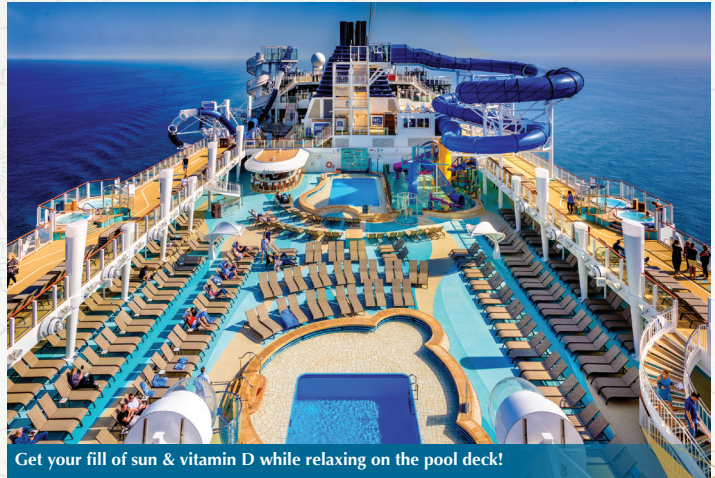
Get your fill of sun & vitamin D while relaxing on the pool deck!