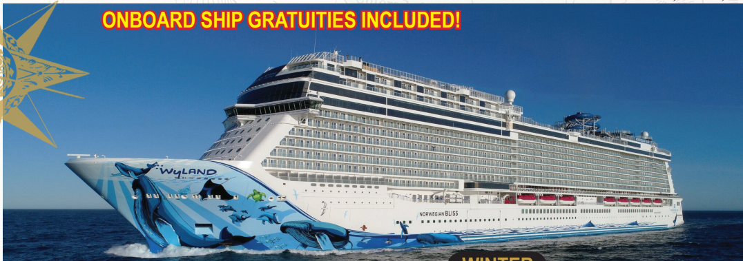
Welcome aboard the 1,094 ft Norwegian Bliss with a crew of 1,716!