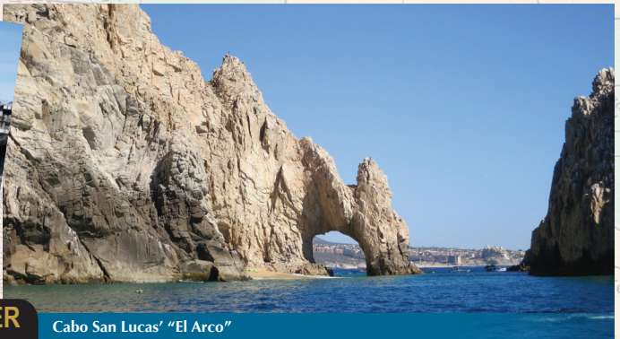
Cabo San Lucas' "El Arco"

7 Night Cruise aboard Norwegian Bliss with Ports of Call at Mexico's Cabo San Lucas, Puerto Vallarta, Mazatlan, and Ensenada