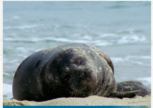
Visit La Jolla to see Sea Lions snoozing in the sun

reception at the hotel before we enjoy an evening performance at The Welk.