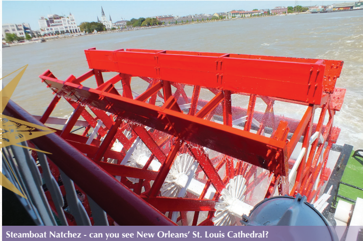
Steamboat Natchez - can you see New Orleans' St. Louis Cathedral?

Hotel: Drury Inn Included Meals: Breakfast, Drury Kickback