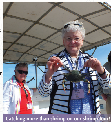
Catching more than shrimp on our shrimp tour!