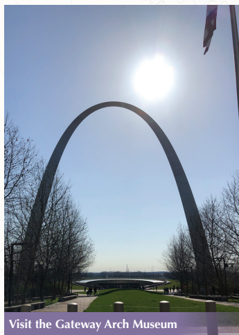
Visit the Gateway Arch Museum