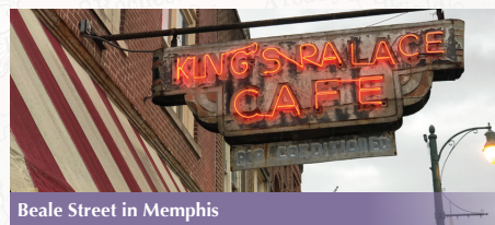
Beale Street in Memphis