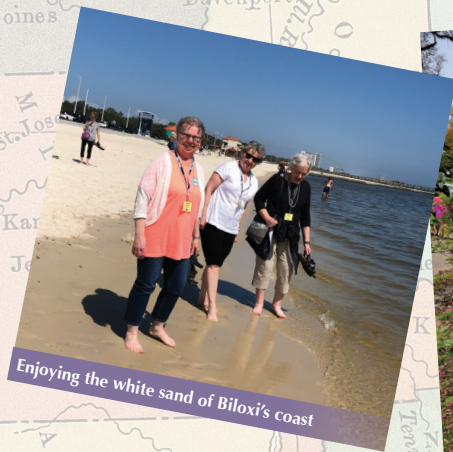
Enjoying the white sand of Biloxi's coast