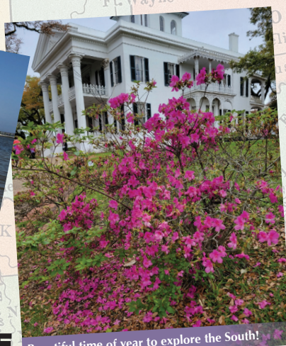
Beautiful time of year to explore the South!