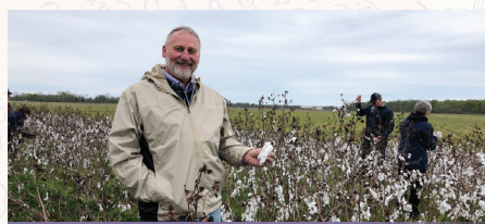
Frogmore - a hands on experience in the world of cotton