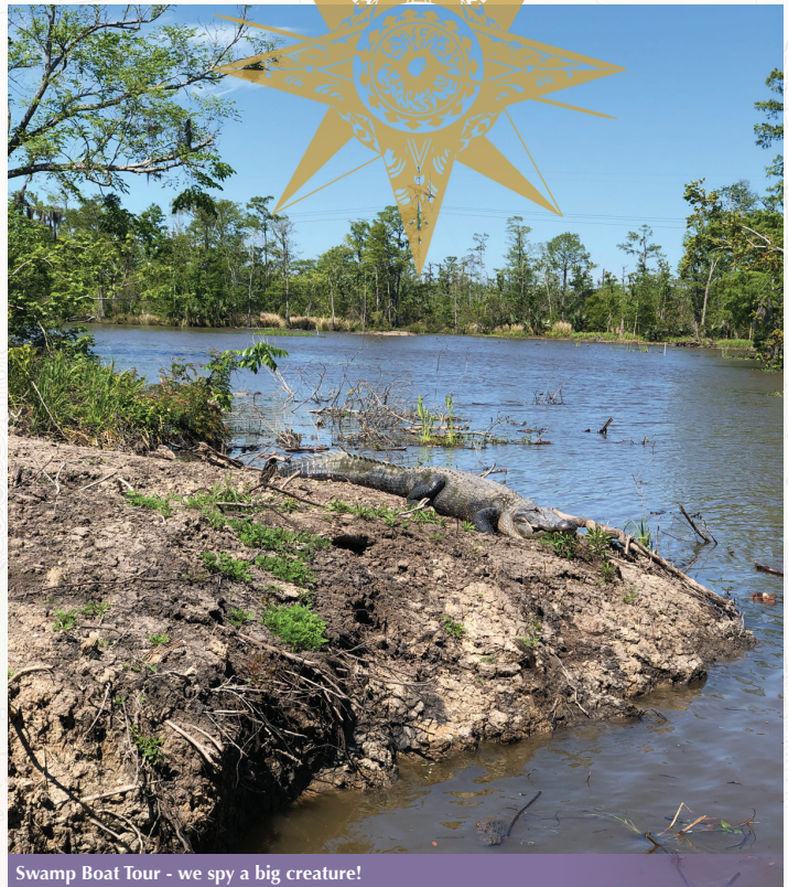
Swamp Boat Tour - we spy a big creature!