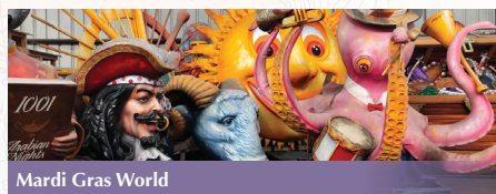
Mardi Gras World