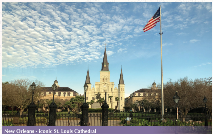
New Orleans - iconic St. Louis Cathedral