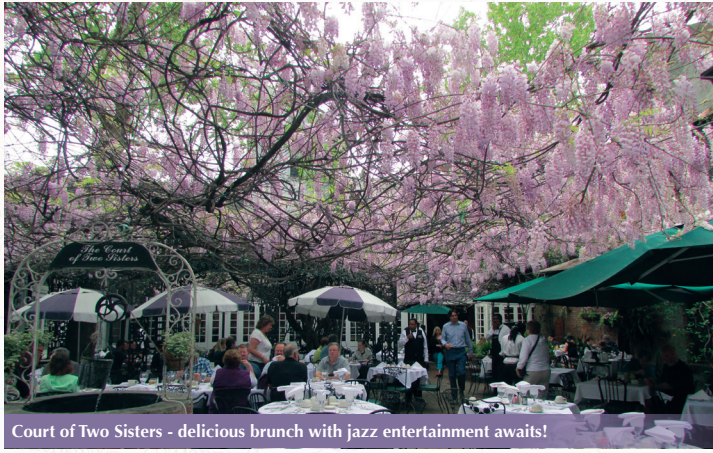
Court of Two Sisters - delicious brunch with jazz entertainment awaits!