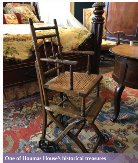
One of Houmas House's historical treasures