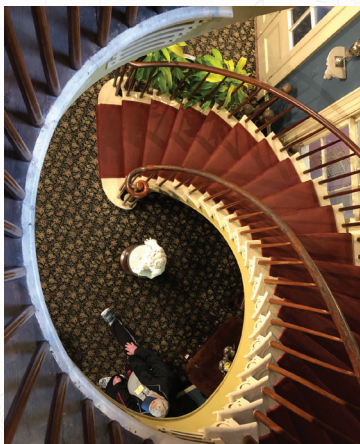
Beautiful staircases! L: Houmas House; R: Guesthouse at Graceland (look familiar?)