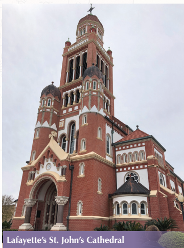
Lafayette's St. John's Cathedral