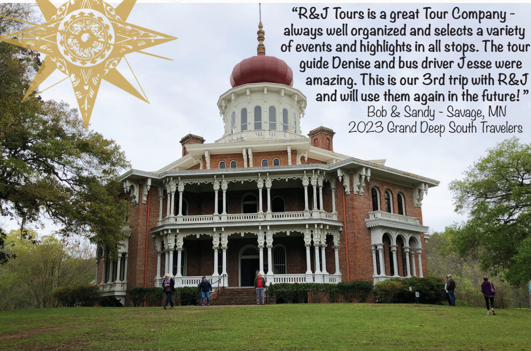
Longwood - largest octagonal house in America. Construction was halted by the Civil War and never fully completed.