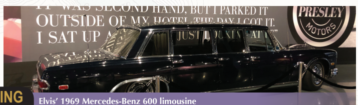
Elvis' 1969 Mercedes-Benz 600 limousine