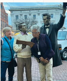
Helpful R&J Travelers!