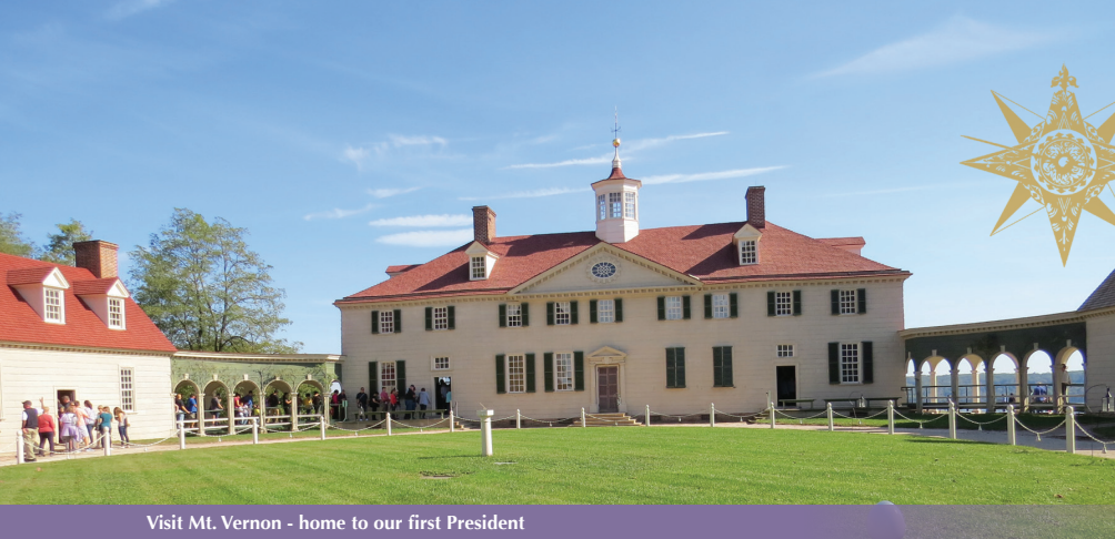
Visit Mt. Vernon - home to our first President