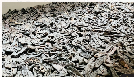
The Holocaust Museum