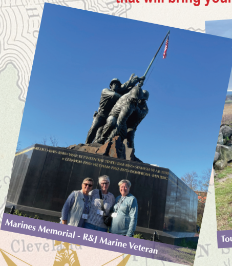
Marines Memorial - R&J Marine Veteran

*This nonstop tour requires extensive walking that will bring your Nation's Capital to life!