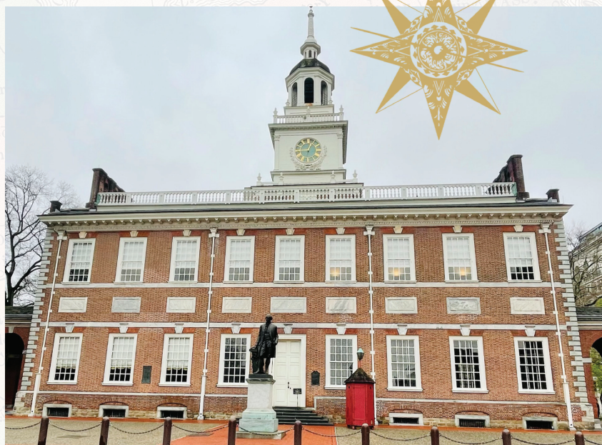
Philadelphia's Independence Hall - Declaration of Independence & US Constitution signed here