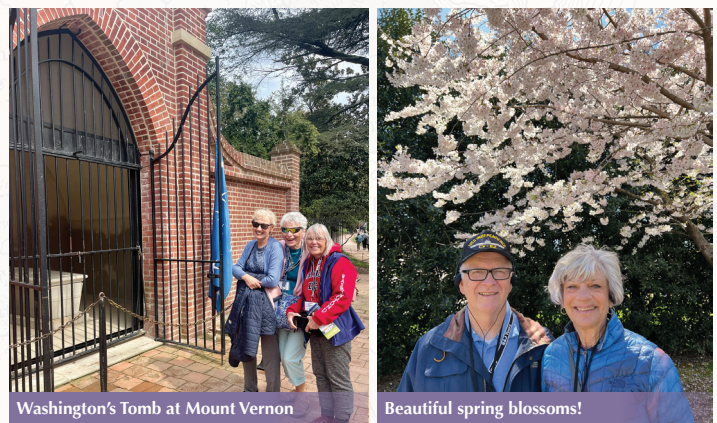
Washington's Tomb at Mount Vernon