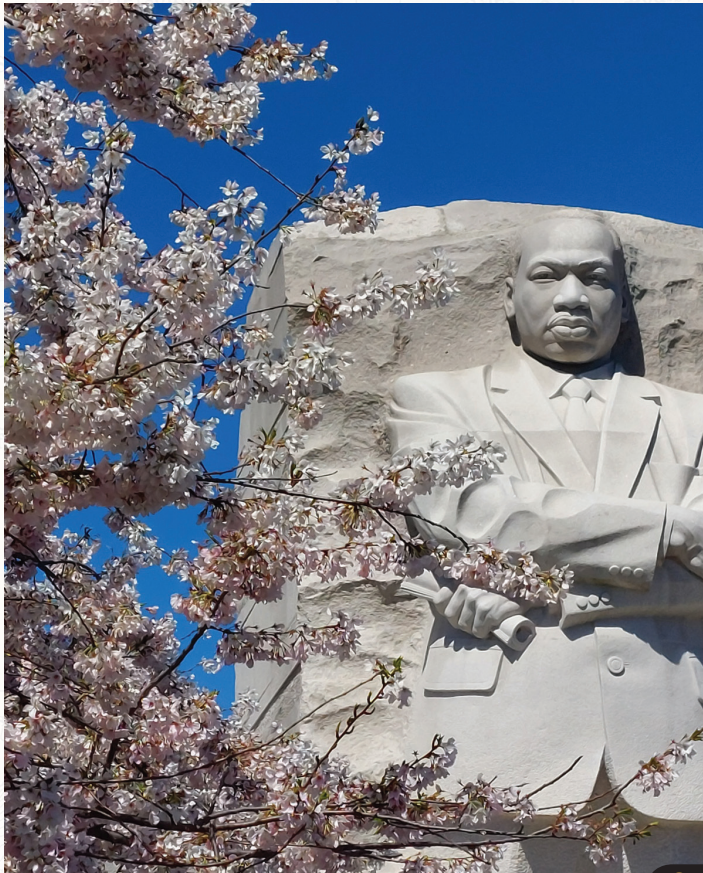
Martin Luther King Jr. Memorial