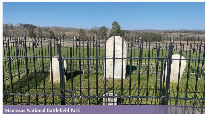
Manassas National Battlefield Park