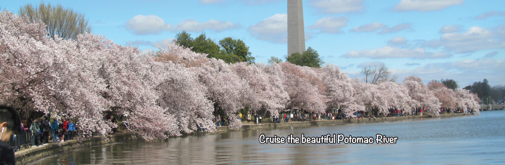
Cruise the beautiful Potomac River