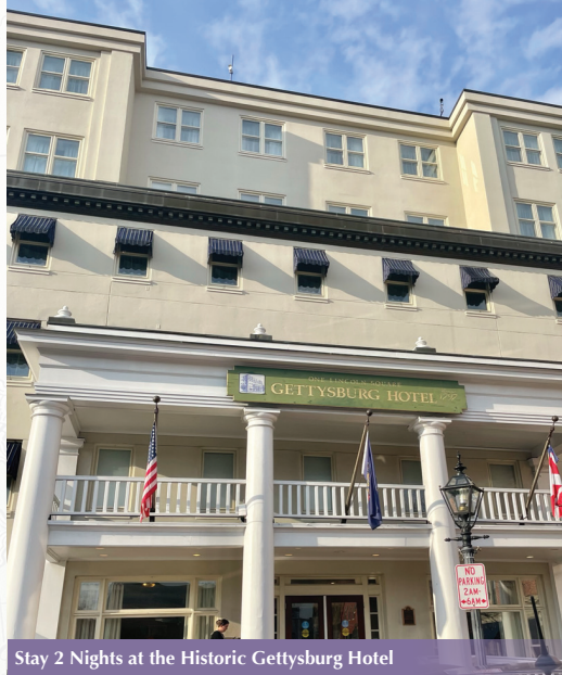
Stay 2 Nights at the Historic Gettysburg Hotel