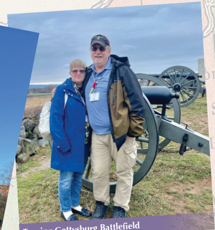
Touring Gettysburg Battlefield