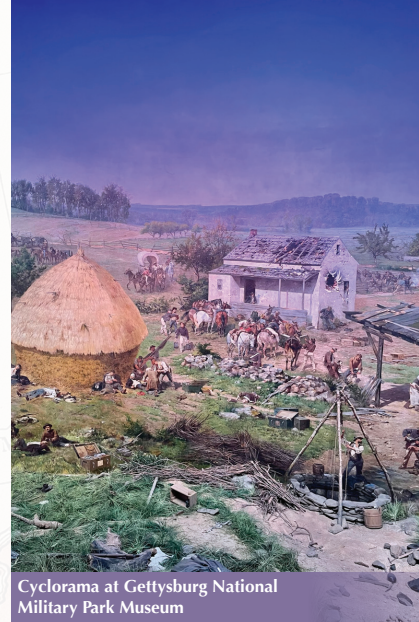
Cyclorama at Gettysburg National Military Park Museum