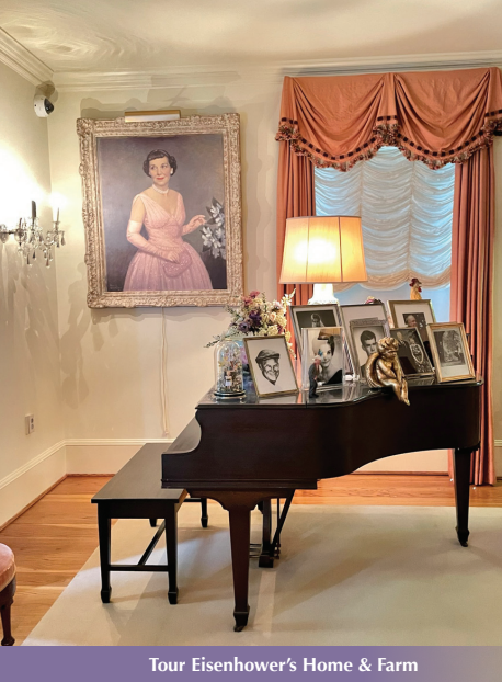
Tour Eisenhower's Home & Farm