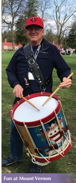
Fun at Mount Vernon