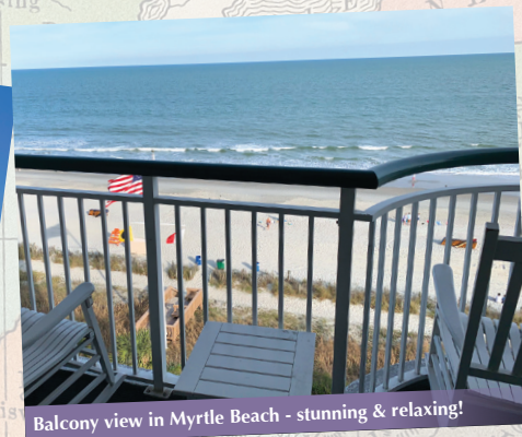
Balcony view in Myrtle Beach - stunning & relaxing!