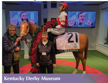
Kentucky Derby Museum