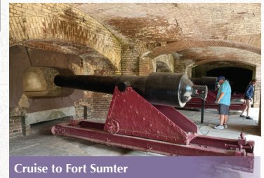
Cruise to Fort Sumter