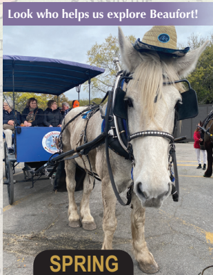
Look who helps us explore Beaufort!