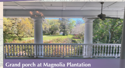
Grand porch at Magnolia Plantation