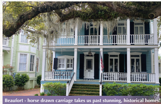
Beaufort - horse drawn carriage takes us past stunning, historical homes!