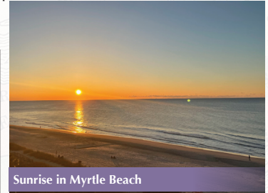
Sunrise in Myrtle Beach