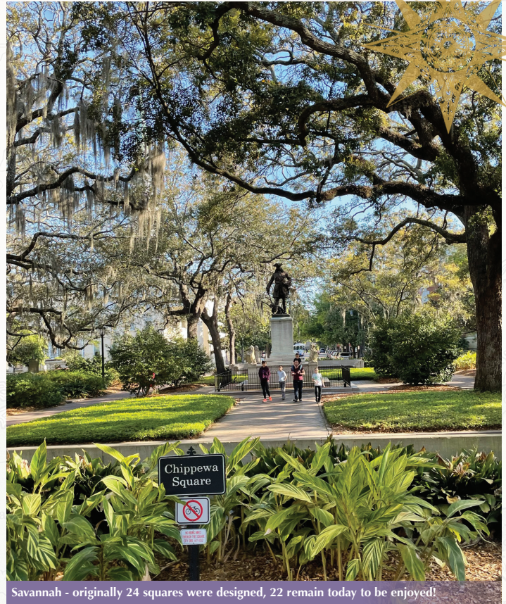
Savannah - originally 24 squares were designed, 22 remain today to be enjoyed!