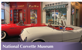
National Corvette Museum