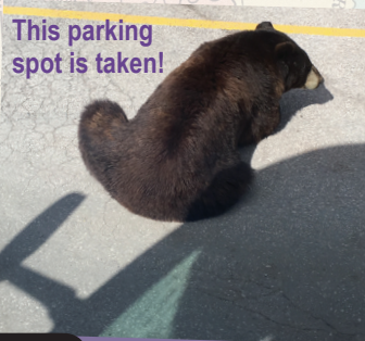
This parking spot is taken!