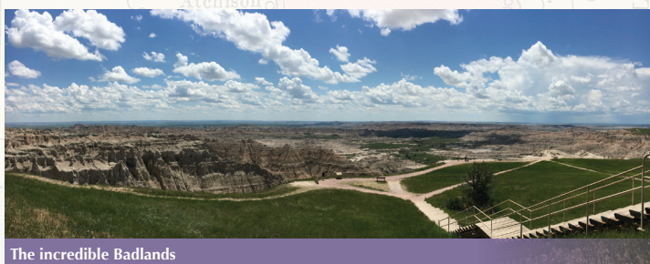
The incredible Badlands