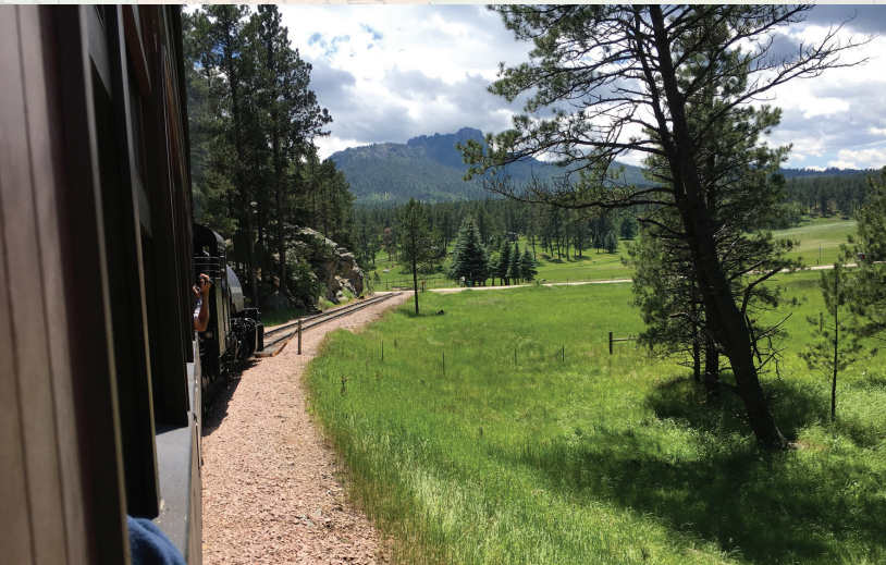
1880 Steam Train - climb aboard, beautiful scenery awaits!