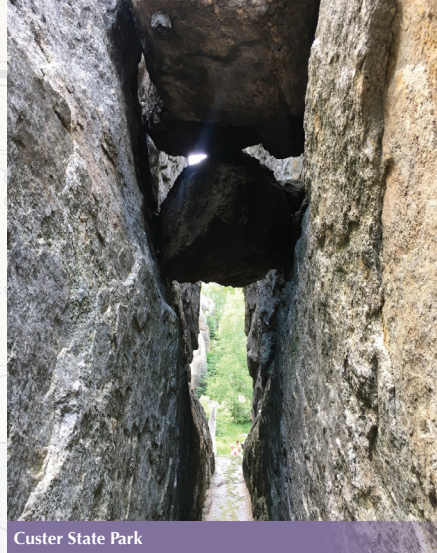
Custer State Park