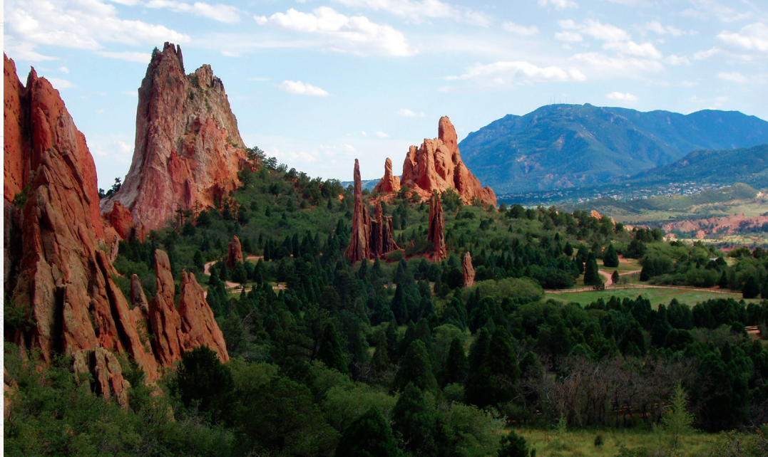
Garden of the Gods - truly spectacular!

After breakfast at the hotel, we are treated to a guided tour of the incredible United States Air Force Academy. We'll thoroughly enjoy their museum, but visiting the Cadet Chapel (if renovations are complete) is sure to be the highlight! Soaring 150 feet toward the Colorado sky, this U.S. National Historic Landmark is the most popular man-made attraction in Colorado. We'll soon understand why! Next we will head to the 19th century brick buildings along Colorado Avenue, known as Old Colorado City, for lunch and shopping on our own. Afterwards we'll experience a guided tour of the U.S. Olympic & Paralympic Training Center. Our