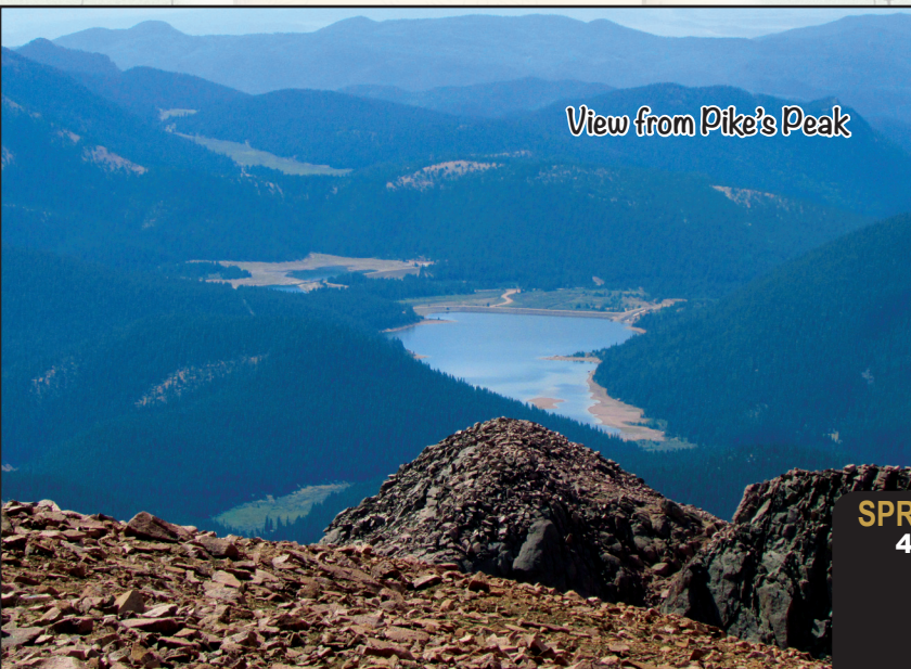
View from Pike's Peak