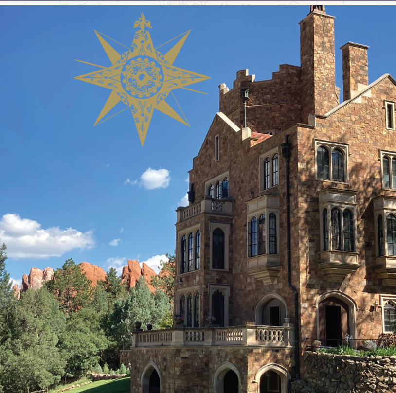
The impressive Glen Eyrie Castle is situated amidst Colorado's natural beauty

tour will begin with a video presentation, followed by a walking tour of the complex. Go Team USA! Arriving back to our hotel, we'll partake in the Kickback's tasty spread again.