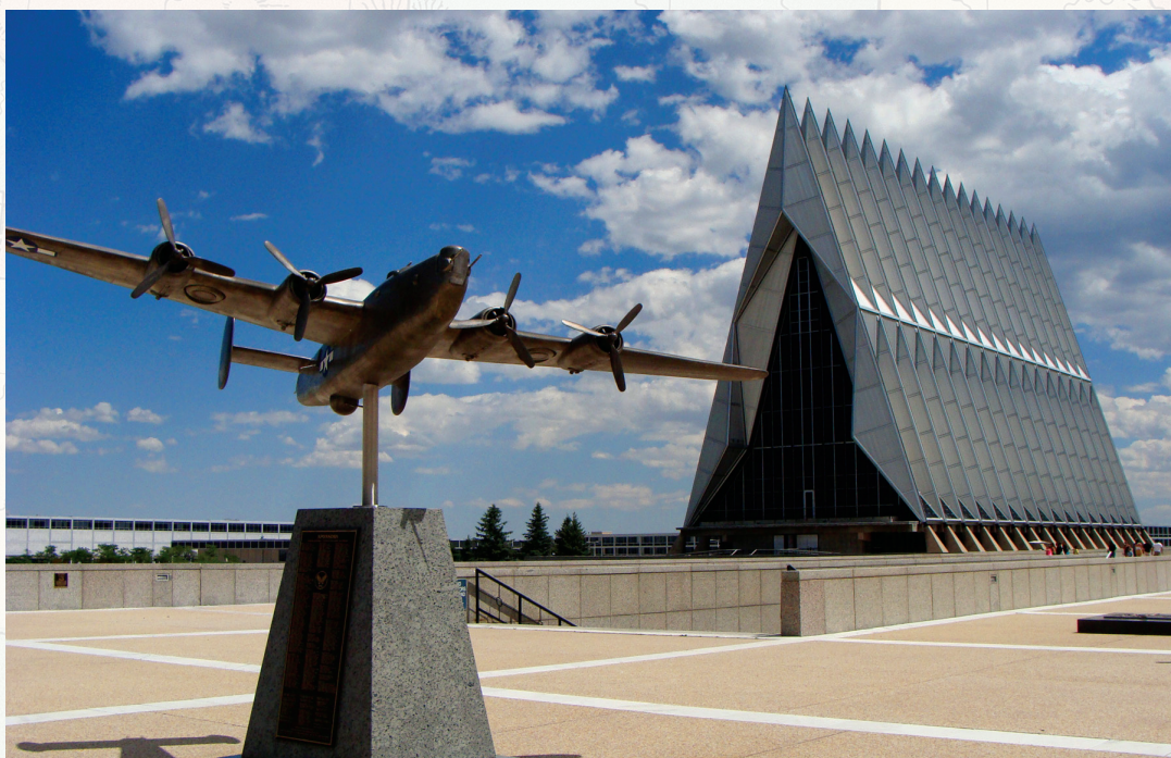
We'll visit the U.S. Air Force Academy with its incredible Cadet Chapel!