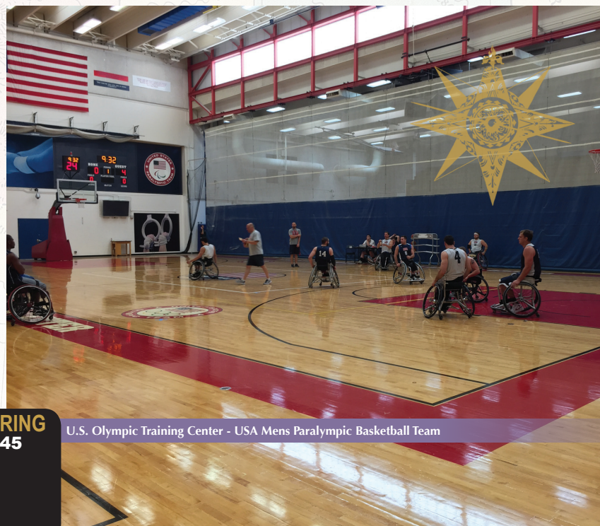
U.S. Olympic Training Center - USA Mens Paralympic Basketball Team