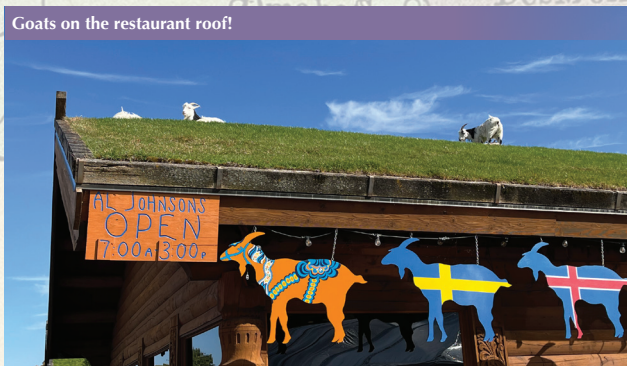
Goats on the restaurant roof!