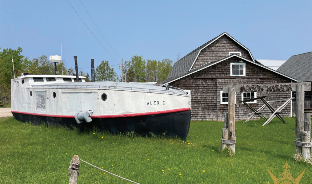
Jackson Harbor on Washington Island