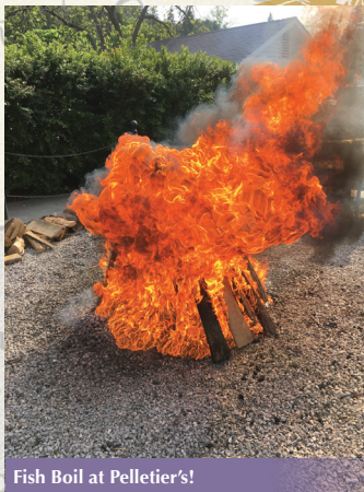
Fish Boil at Pelletier’s!