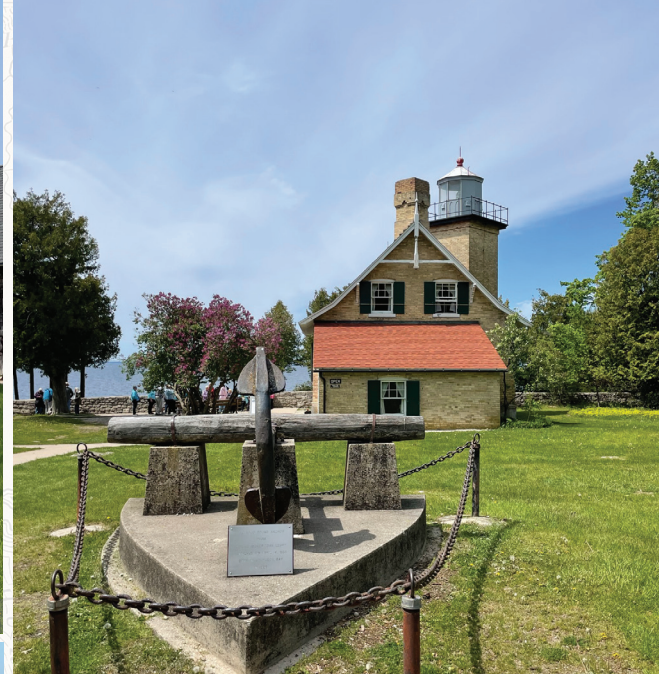
Explore Eagle Bluff Lighthouse - built in 1868!