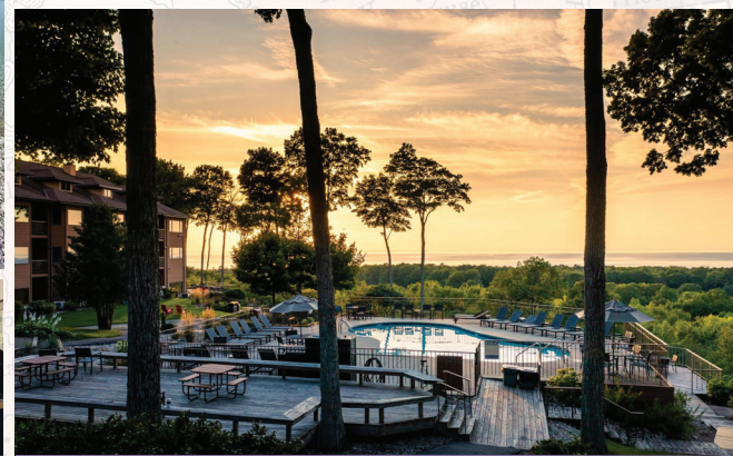
The Landmark Resort - enjoy the sunset on the bay of Green Bay

resort, you will have the rest of the evening to relax by a fire pit, hit the pool or courts, or if you're feeling adventurous, enjoy a scenic walk along Red Loop or Patti's Path.