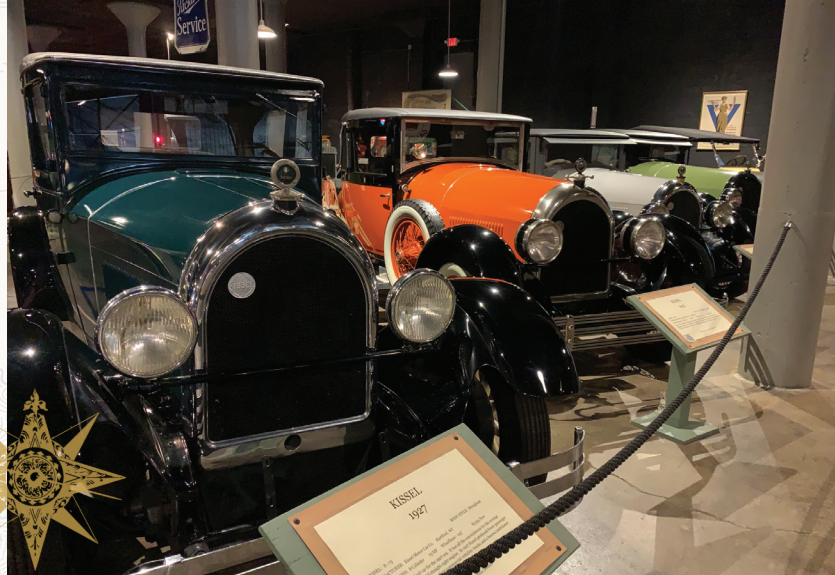
What classics we will find at the Wisconsin Automotive Museum!

After breakfast we will depart the hotel and make our way to Illinois where the Celebration Belle riverboat awaits to