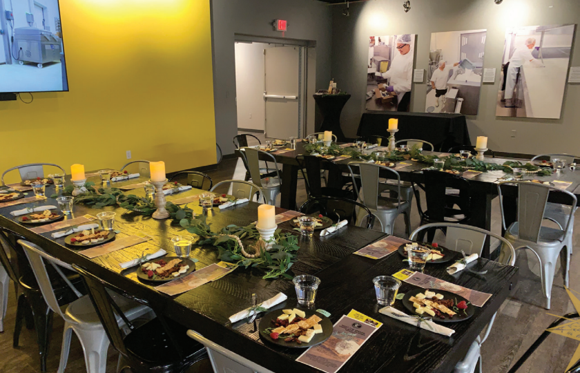
A wonderful experience is in store at Le Clare Creamery!