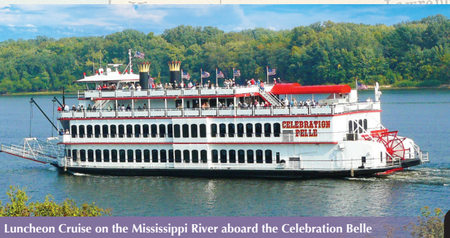
Luncheon Cruise on the Mississippi River aboard the Celebration Belle