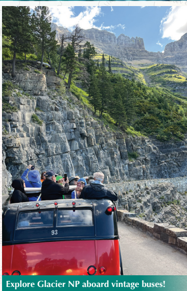
Explore Glacier NP aboard vintage buses!