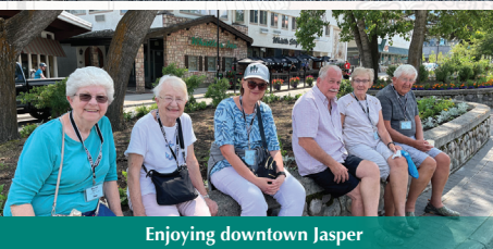
Enjoying downtown Jasper