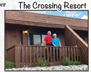
The Crossing Resort