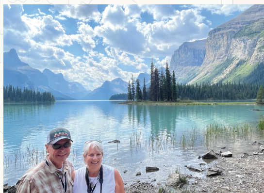
Ready to take in picturesque Spirit Island on Lake Maligne cruise!