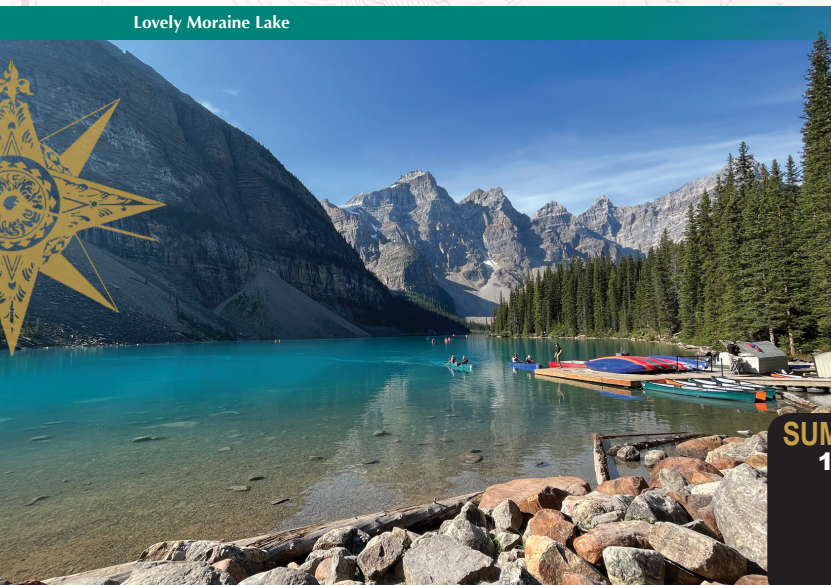
Lovely Moraine Lake