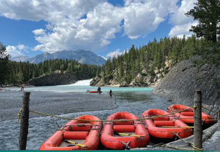
Bow River rafts are ready!