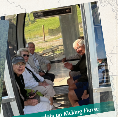
Taking the gondola up Kicking Horse