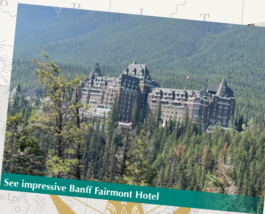
See impressive Banff Fairmont Hotel