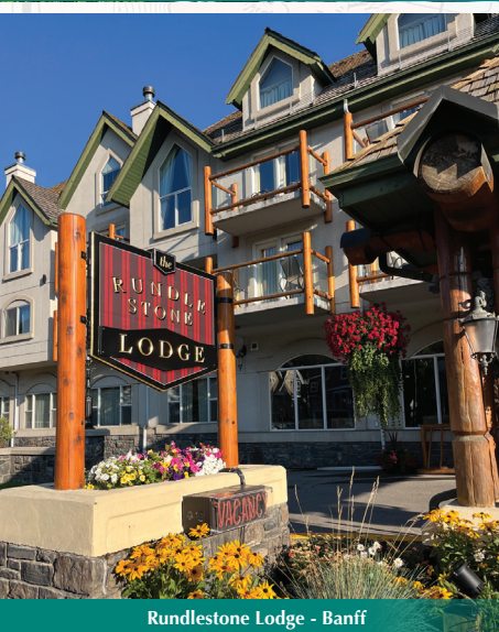
Rundlestone Lodge - Banff