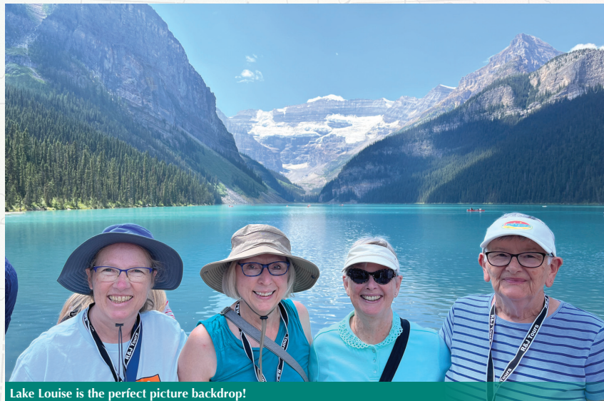
Lake Louise is the perfect picture backdrop!