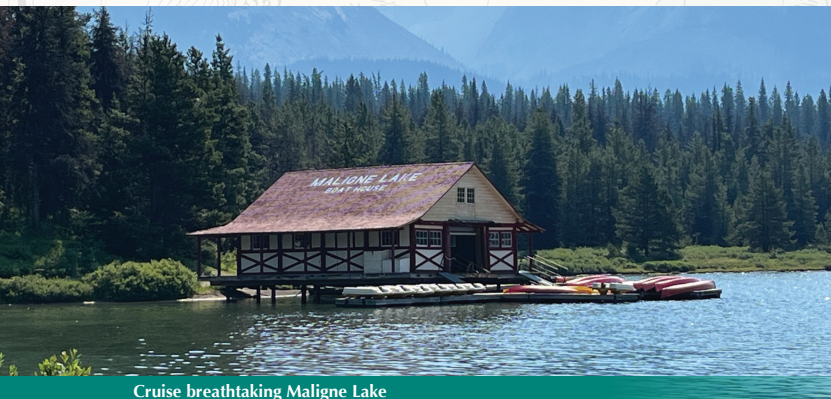
Cruise breathtaking Maligne Lake