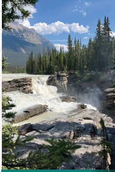
Athabasca Falls in Jasper National Park