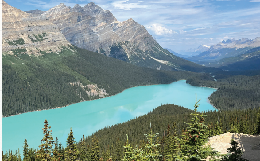
Peyto Lake - truly a magnificent sight!