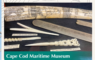
Cape Cod Maritime Museum