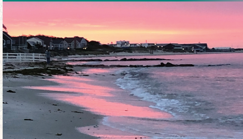
We'll stay 5 nights right on the Cape's sandy shore & enjoy the sunsets!

6a, the Old King's Highway, a scenic byway winding through centuries of Cape Cod history. It winds past hundreds of historic structures which characterize its early development. View the Eastham Windmill, a Cape Cod Lighthouse and visit the Cape Cod National Seashore Visitor's Center. In 1961, President Kennedy signed legislation establishing an American treasure, the Cape Cod National Seashore, protecting the fragile coastline from Chatham to Provincetown. A long-time summer resident of the Cape, JFK had co-sponsored the legislation while in the Senate. The goal, he wrote, was "to preserve the natural and historic values of a portion of Cape Cod for the inspiration and enjoyment of people all over the United States." This was the first time the federal government had created a national park out of land that was primarily in private hands. Today the Seashore encompasses more than 43,000 acres and draws more than 4,000,000 visitors a year. Sand dunes and the ocean surround us as we approach "Land's End" – Provincetown. We are now at the extreme tip of Cape Cod. Formerly known as the "Province Lands," the pilgrims landed here first before they decided to settle across the Bay in Plymouth. Take some time to enjoy the wonderful variety of restaurants, shops, and galleries