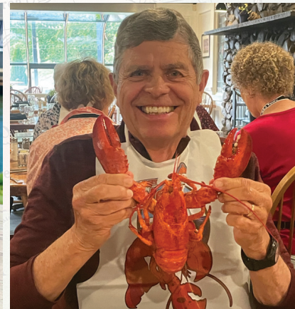
This will be tasty!!