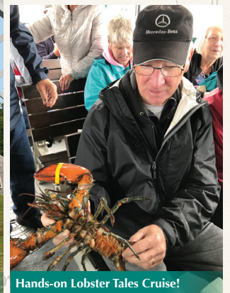
Hands-on Lobster Tales Cruise!