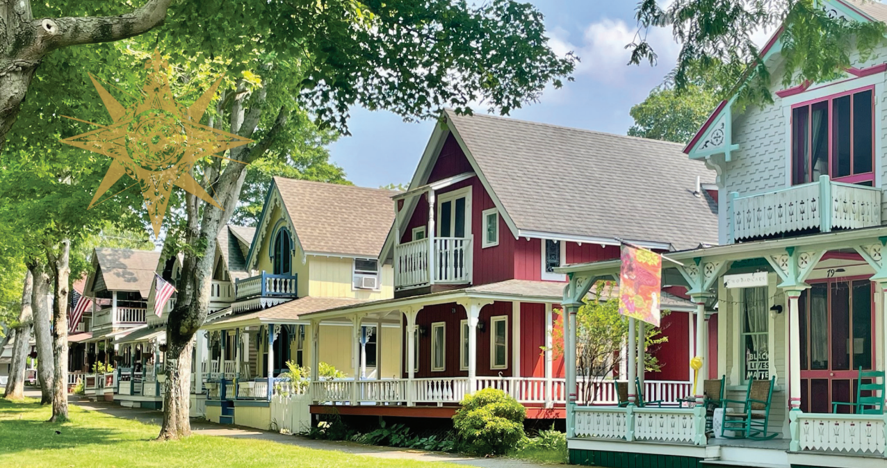
Martha's Vineyard - quaint & colorful "Cottage City" in Oak Bluffs