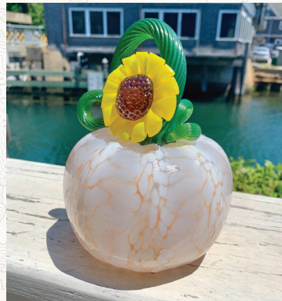
Sandwich Glass Museum masterpiece