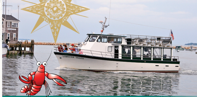
Set sail on a Lobster Tales Cruise - we'll roll up our sleeves & help haul in the traps!

Following breakfast this morning we will travel historic route