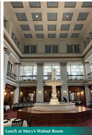
Lunch at Macy's Walnut Room