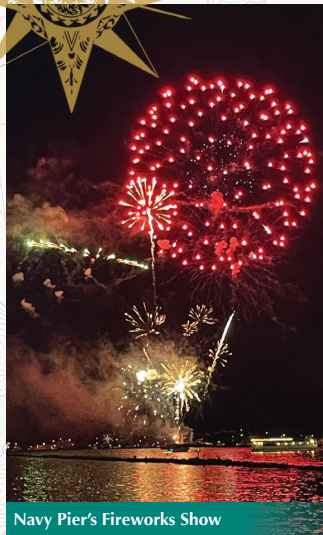
Navy Pier's Fireworks Show