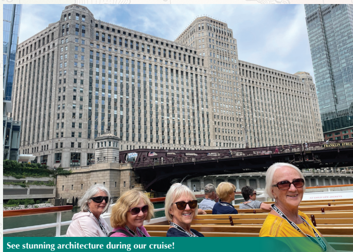
See stunning architecture during our cruise!