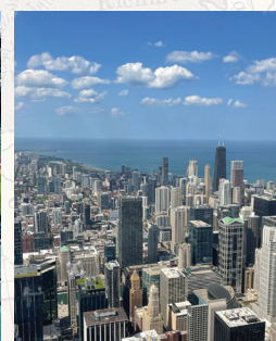
Incredible view from Skydeck