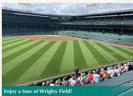
Enjoy a tour of Wrigley Field!