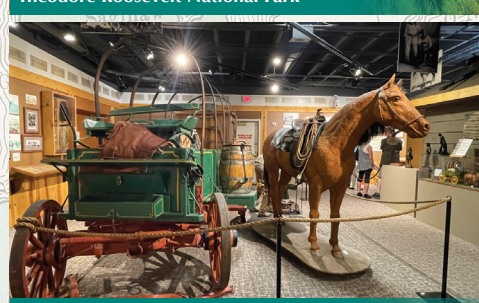
North Dakota Cowboy Hall of Fame

"Home, home on the Range Where the deer and the antelope play Where seldom is heard, a discouraging word For what can an antelope say..."