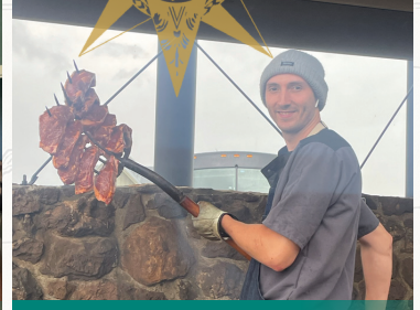
Steaks loaded on pitchforks western style!