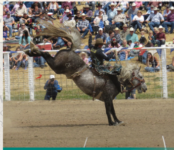
Champions Rodeo - enjoy reserved seats!