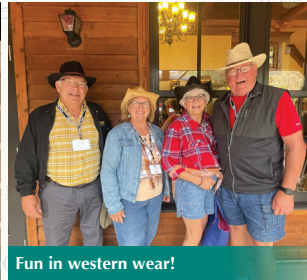
Fun in western wear!