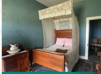
Tour Chateau de Mores

Another hearty breakfast buffet prepares us for our adventures today. Just a short drive west of Medora is Father Cassidy's ranch for needy boys and girls, the nationally acclaimed Home on the Range. In a truly authentic setting we have the privilege of