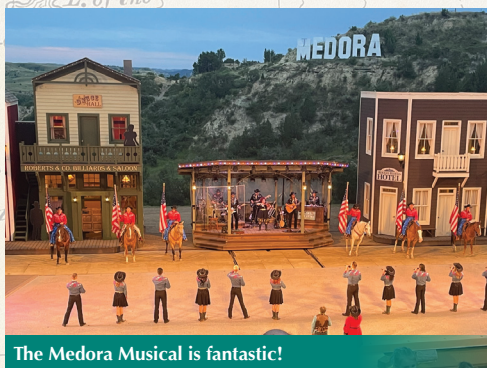
The Medora Musical is fantastic!