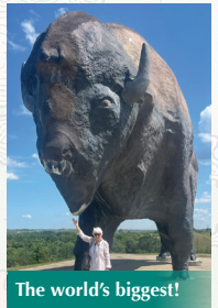
The world's biggest!

witnessing the ranch's 66th annual Champions Ride Saddle Bronc Rodeo. An exclusive orientation tour of the ranch, lunch in the Home on the Range kitchen, and special reserved seating for the rodeo has all been arranged for our group. This will truly be an unequalled experience you will want to share with family and friends when you return. We return to Medora this afternoon to relax before we have dinner on the Schaefer Center Patio.