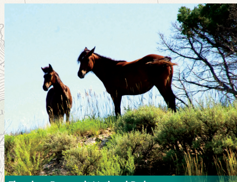
Theodore Roosevelt National Park