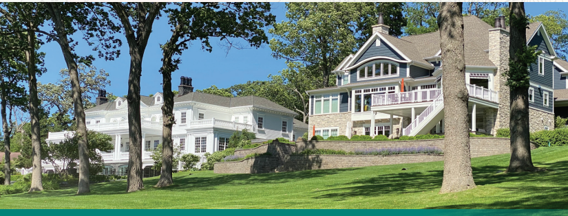
Be sure to walk along the lake's shoreline path to take in gorgeous old & new homes!

collections including the world's largest carousel, a 200' sea creature, automated music machines and much more. Arrive home having made new travel friends and fondly remembering Lake Geneva's Gems!