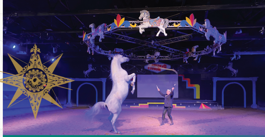
Be awed as you watch these beautiful creatures at the Dancing Horses Theatre!

After breakfast we bid beautiful Lake Geneva farewell and begin our journey home. Along the way, we'll visit House on the Rock, an awesome retreat built atop a chimney of rock. On our self-guided tour, we'll explore some of the most unique