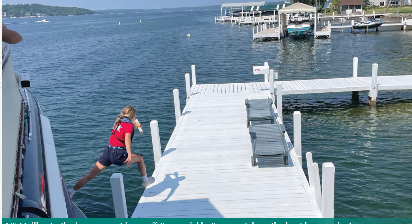
US Mailboat - the jumper must jump off & on quickly & accurately as the boat keeps going!