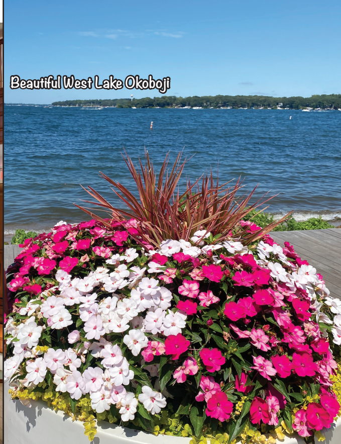
Beautiful West Lake Okoboji