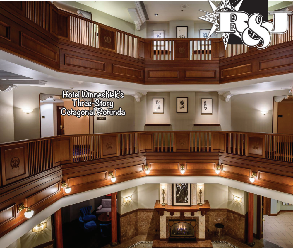
Hotel Winneshiek's Three-Story Octagonal Rotunda