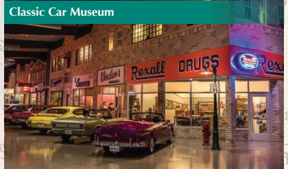
Classic Car Museum