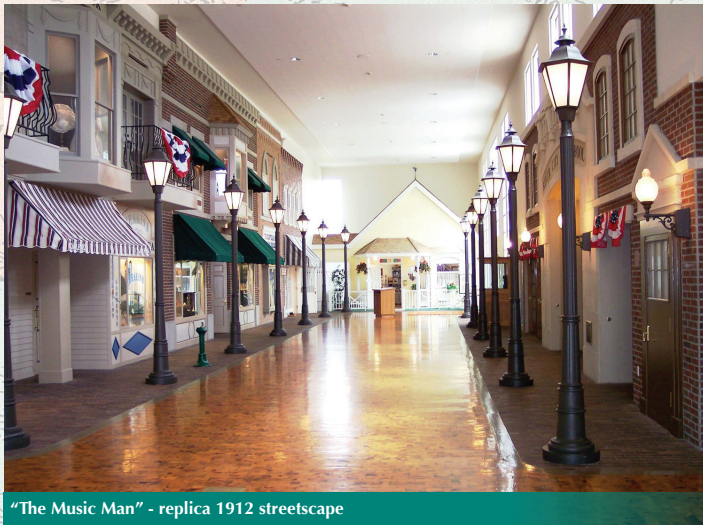
"The Music Man" - replica 1912 streetscape