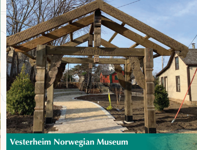
Vesterheim Norwegian Museum