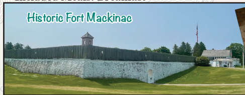
Historic Fort Mackinac