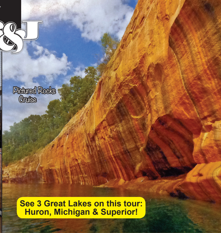
Pictured Rocks Cruise

Enjoy the quiet, slow pace of Mackinac Island!