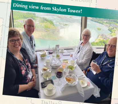
Dining view from Skylon Tower!

"We had an amazing trip to Niagara Falls and enjoyed every part of our adventure! Great planning, organization, and we were always well informed! We would recommend R&J Tours to all! We loved starting our day talking to God & giving Him our day."