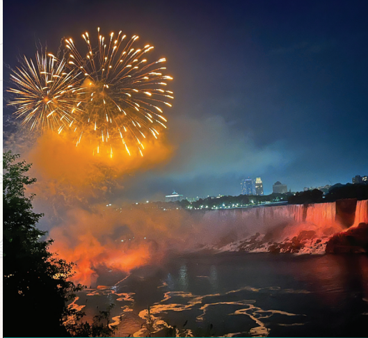
Niagara Falls illuminated at night!