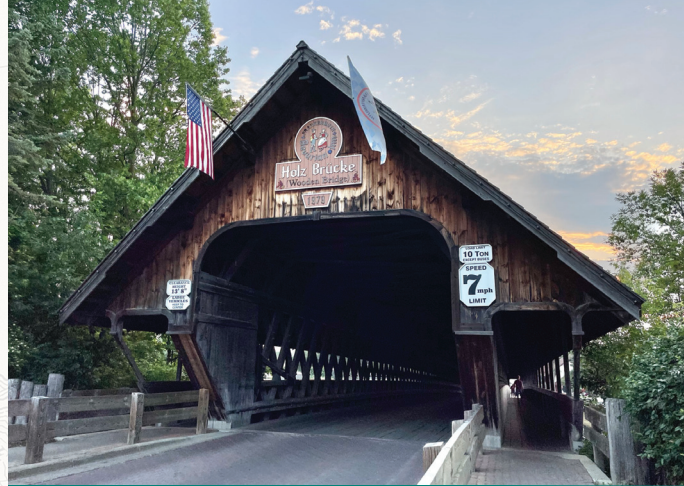
Cross the 239' Holz Brücke Bridge to Frankenmuth's Bavarian Inn