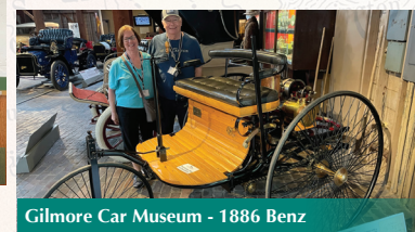
Gilmore Car Museum - 1886 Benz