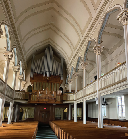
Frankenmuth - St. Lorenz Church