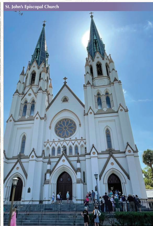
St. John's Episcopal Church