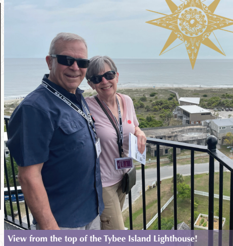
View from the top of the Tybee Island Lighthouse!