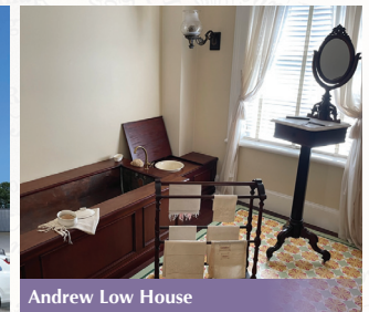
Andrew Low House