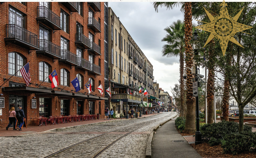
Historic River Street in Savannah - parallels the bustling Savannah River