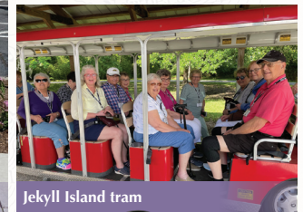
Jekyll Island tram