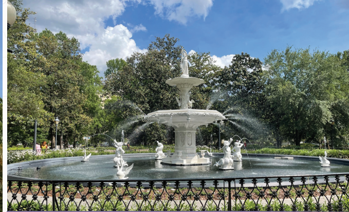
Iconic Forsyth Park Fountain - it was ordered from a catalogue!