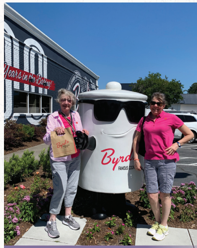
Byrd Cookie Company