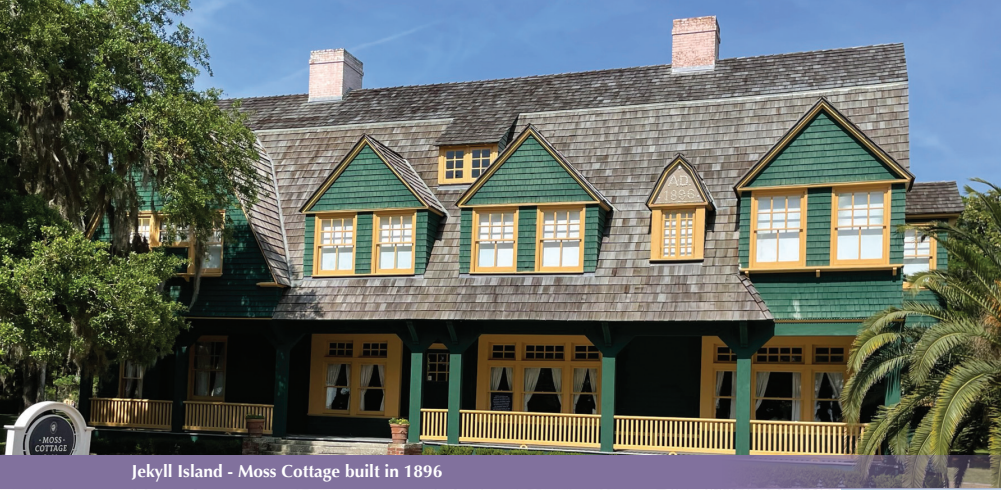
Jekyll Island - Moss Cottage built in 1896