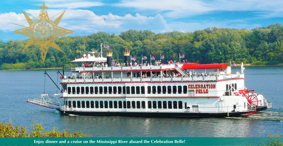
Enjoy dinner and a cruise on the Mississippi River aboard the Celebration Belle!