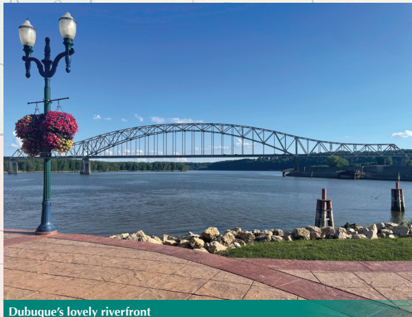
Dubuque's lovely riverfront