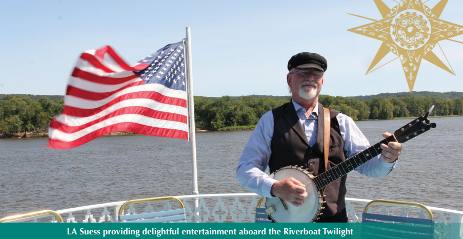
LA Suess providing delightful entertainment aboard the Riverboat Twilight