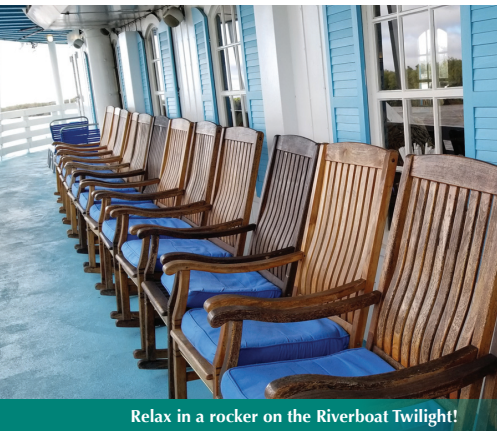
Relax in a rocker on the Riverboat Twilight!