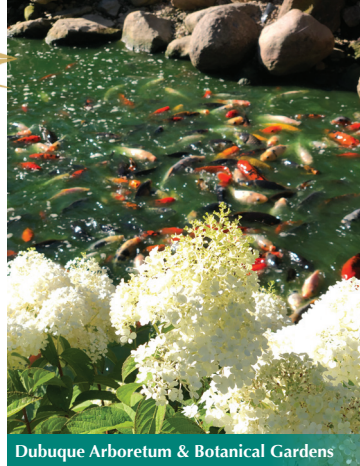
Dubuque Arboretum & Botanical Gardens