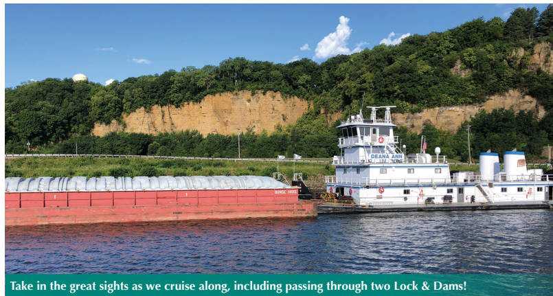
Take in the great sights as we cruise along, including passing through two Lock & Dams!