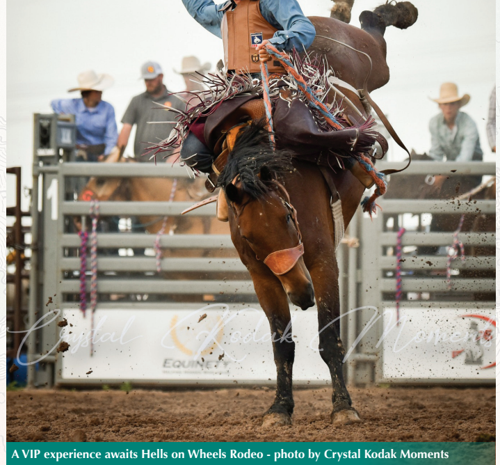
A VIP experience awaits Hells on Wheels Rodeo