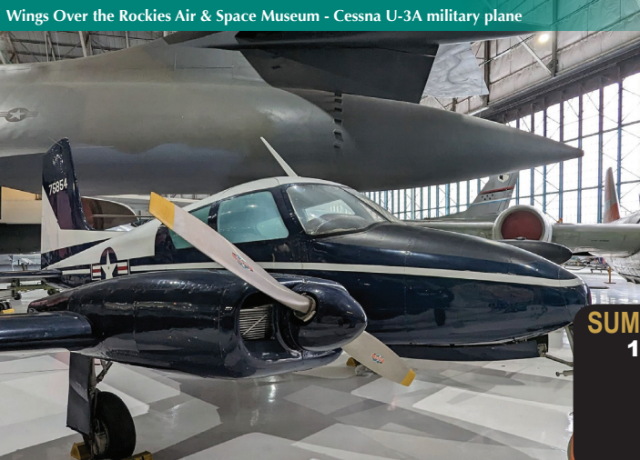
Wings Over the Rockies Air & Space Museum - Cessna U-3A military plane

This is Crystal of Morning Fresh Dairy Farm!