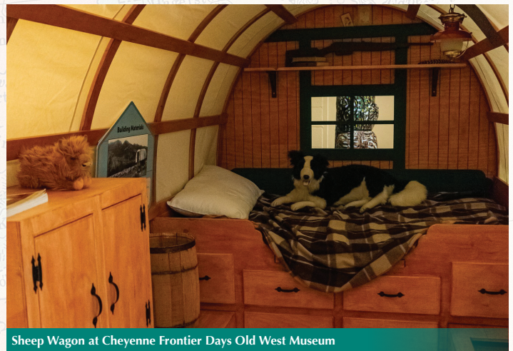
Sheep Wagon at Cheyenne Frontier Days Old West Museum