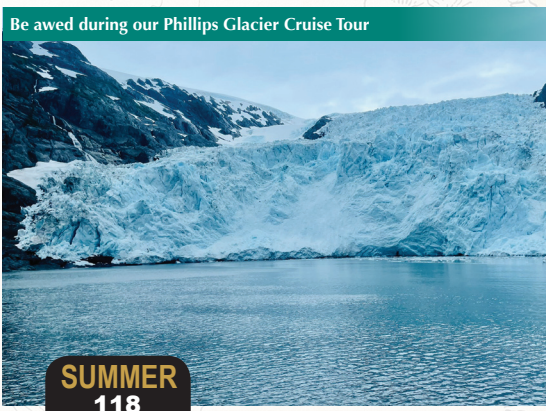
Be awed during our Phillips Glacier Cruise Tour