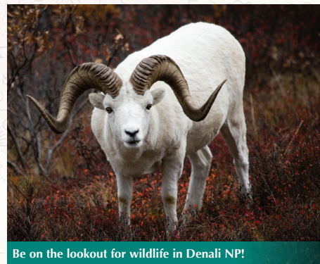
Be on the lookout for wildlife in Denali NP!

some time at Exit Glacier. Then we check into our lodge outside of Seward for the next two nights. We'll enjoy a meal together on the property tonight and you'll have time under the midnight sun to explore more of our resort area or shuttle into Seward to check out the town.