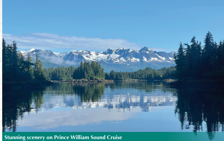
Stunning scenery on Prince William Sound Cruise

Today we'll head out early for an adventure cruise across Prince William Sound to Whittier, aboard a narrated cruise through the sound. See beautiful glaciers, abundant wildlife and unprecedented scenery along the route. We'll enjoy lunch on board. Once we arrive in Whittier, we'll board our waiting motorcoach. We travel the Seward Highway with several scenic stops along the way, including