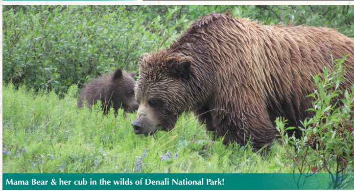
Mama Bear & her cub in the wilds of Denali National Park!