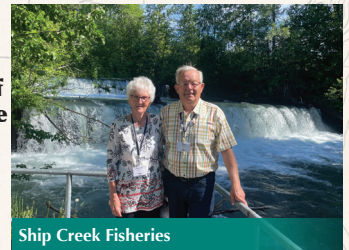
Ship Creek Fisheries

We'll cruise Resurrection Bay and experience lunch on Fox Island before heading along the Sterling Highway to the Halibut Fishing Capital of the World, Homer, for more discovery & maybe a whole lot of fishing! Continue along one of America's most scenic roads, the Seward Highway, to the lovely village of Seward. Drive along Turnagain Arm, a fjord of water which boasts some of the highest tide waters in the world, keeping an eye out for Beluga whales.