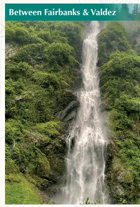
Between Fairbanks & Valdez