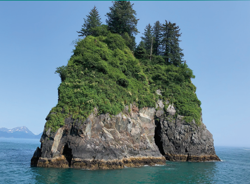
Spire Cove off Kenai Peninsula - Resurrection Bay Cruise