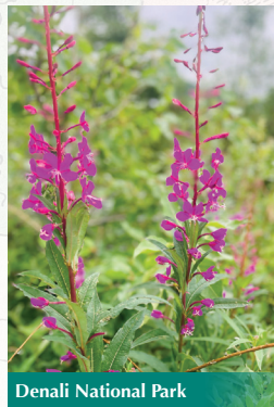
Denali National Park