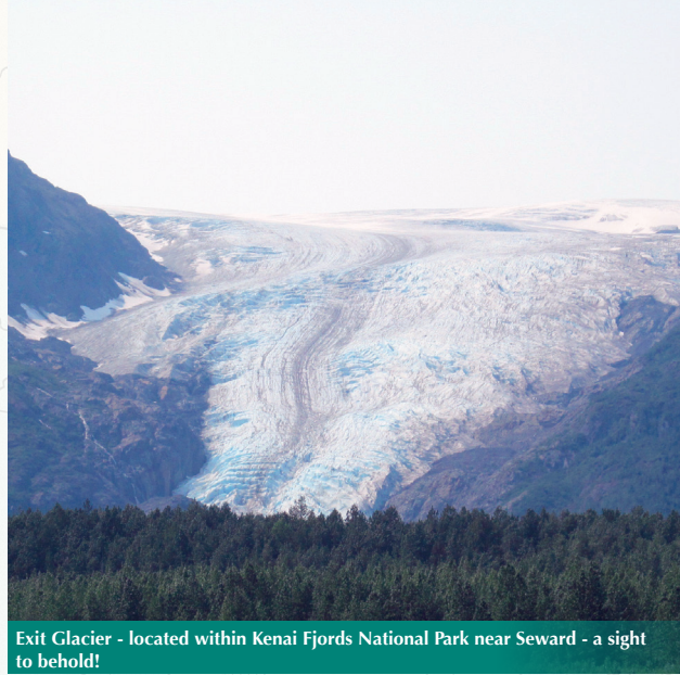
Exit Glacier - located within Kenai Fjords National Park near Seward - a sight to behold!