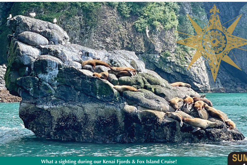
What a sighting during our Kenai Fjords & Fox Island Cruise!