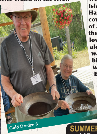
Gold Dredge 8