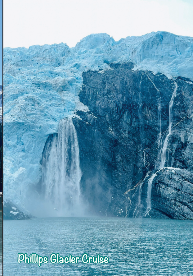
Phillips Glacier Cruise