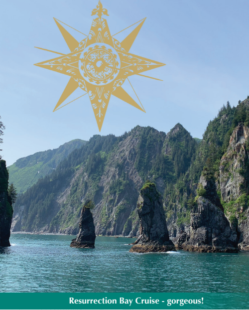
Resurrection Bay Cruise - gorgeous!