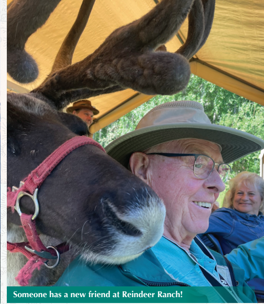
Someone has a new friend at Reindeer Ranch!