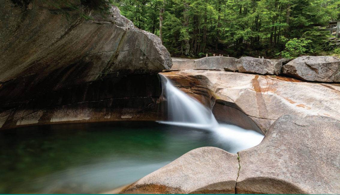
The Basin - Franconia Notch State Park