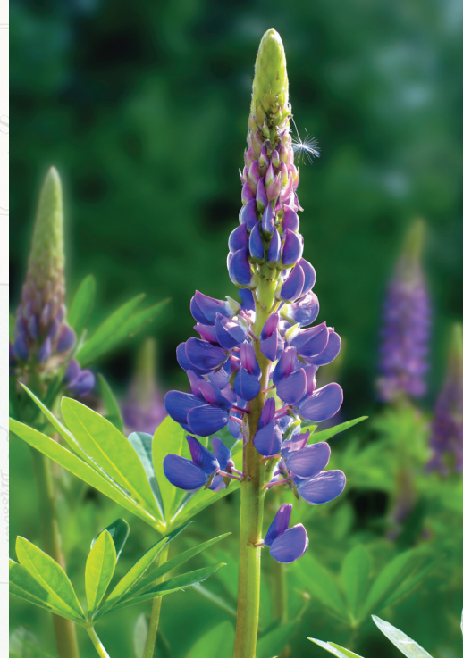
Our guide takes us to see lovely lupines!