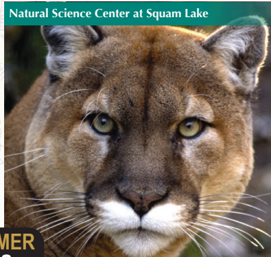
Natural Science Center at Squam Lake

Enjoy breakfast at your leisure at the resort before we're off with our local guide for day of adventures. First, we'll board the world's first mountain climbing cog railway to experience a scenic train ride to the Summit of Mount Washington, the Northeast's Highest Peak! Powered by either steam or diesel, our round-trip cog ride takes approximately three hours, including about an hour stop at the summit. (Tip: Bring a jacket or sweater but remember that