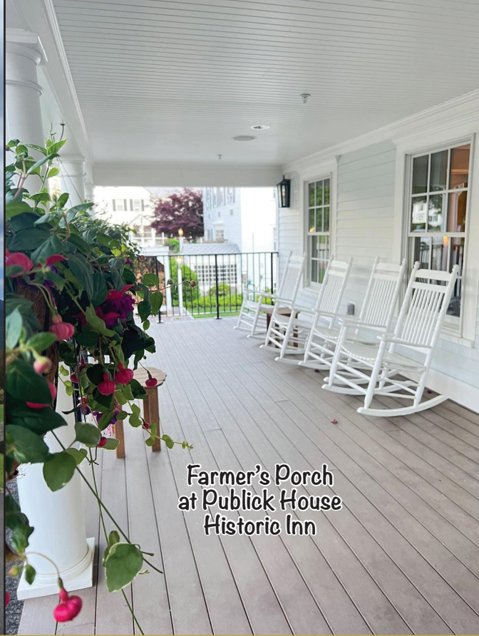
Farmer's Porch at Publick House Historic Inn