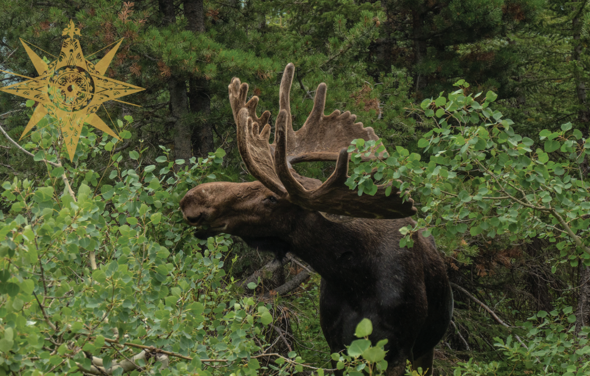
Wild Moose are on the loose and we get to go searching for these massive animals!