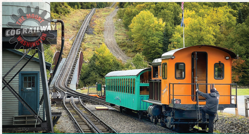
Up we go on Mount Washington aboard the Cog Railway!

Breakfast is included this morning at our resort. Then we'll meet our local guide for a fantastic day of touring. First, we'll see the field of lupines. Paying homage to the annual blossoming of this captivating wildflower, the Fields of Lupine Blooming is a time-honored regional event. The brilliant spikes of the lupine flower carpet local fields and pastures in a rolling sea of vibrant purples, pinks, blues and whites. The long-lasting blossoms attract equally dazzling butterflies and create a breathtaking floral display against the majestic backdrop of the Franconia, Presidential, and Kinsman Mountain ranges. Our guide will stop at several places where the lupines are known to bloom so we can take pictures. Next, we'll visit a Christmas tree farm and take a horse-drawn wagon ride through the Christmas tree fields! We'll learn all about the farm as well as tree farming. Lunch is included at a local restaurant before we tour through the scenic White Mountains of New Hampshire. In Franconia Notch State Park, we'll take a short walk to see a geological wonder - the Basin, a large granite pothole that was created by a glacier. We'll also enjoy a stop at the Franconia Notch