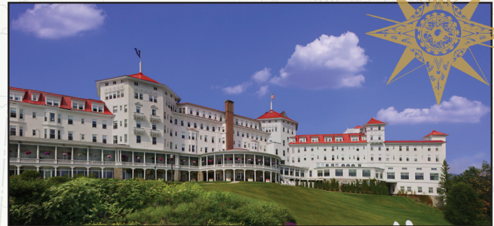
Moose on the Loose in New Hampshire