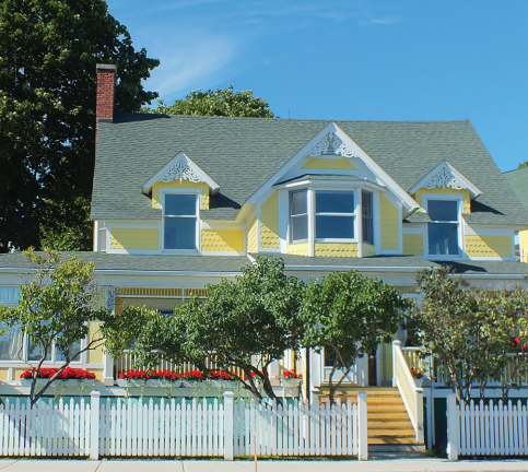
See Mackinac Island by horse-drawn buggy