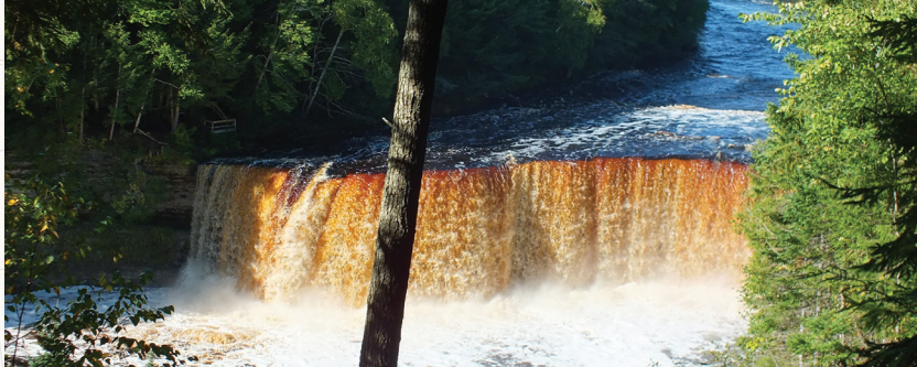
The coloring of Upper Tahquamenon Falls is unique!