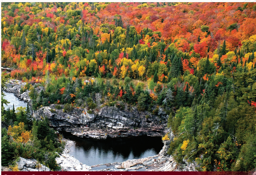
Our Agawa Canyon Train tour provides exquisite views!

Hotel: Hamilton Inn Select Beachfront (Lakefront Rooms!)