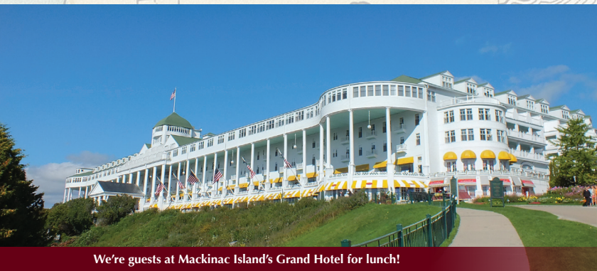
We're guests at Mackinac Island's Grand Hotel for lunch!