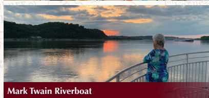
Mark Twain Riverboat