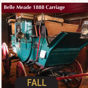
Belle Meade 1888 Carriage