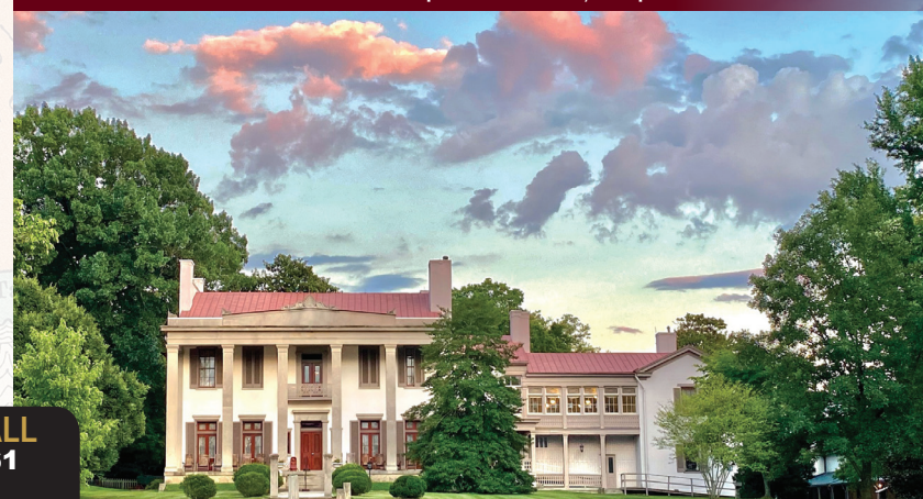
Our visit to the Belle Meade Mansion includes a plantation & winery tour plus lunch!