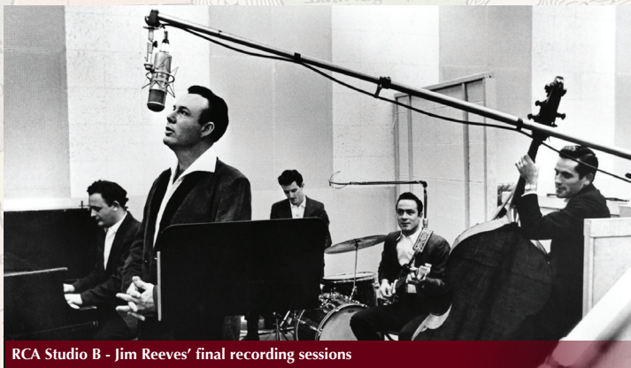
RCA Studio B - Jim Reeves' final recording sessions

That dynamic, magical place, famously known as Music City USA . Behind-The-Scenes. Inside Scoop. Backstage. Whatever you want to call it, we'll experience it the way you've always wanted to. Three full days of Musical Memories!