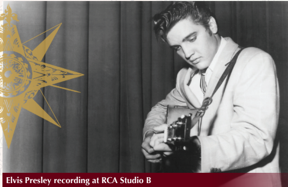
Elvis Presley recording at RCA Studio B