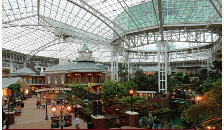
Time will be given to explore Gaylord Opryland's incredible atrium