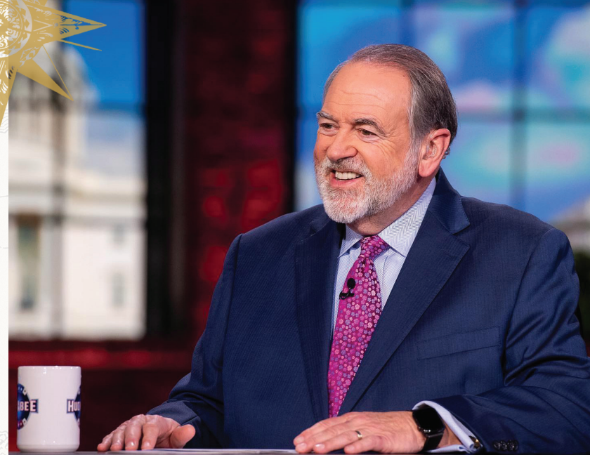
Experience a live TV taping as well as a Meet & Greet with Governor Huckabee!