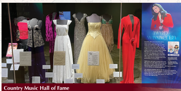
Country Music Hall of Fame