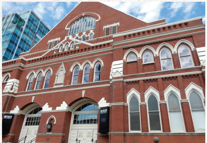
Ryman Auditorium - this famous landmark was originally built as a church in 1892