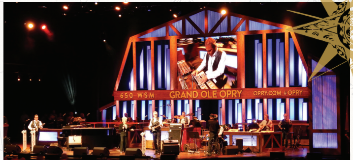
Experience a backstage tour plus a country show at the Grand Ole Opry!