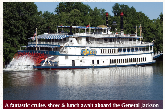
A fantastic cruise, show & lunch await aboard the General Jackson