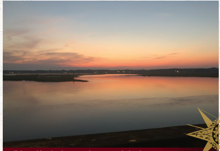
We'll thoroughly enjoy the spectacular sunsets & the beach at our Resort!

We are now at the extreme tip of Cape Cod. Formerly known as the “Province Lands,” the pilgrims landed here first before they decided to settle across the Bay in Plymouth. Take some time to enjoy the wonderful variety of restaurants, shops, and galleries that make this artists/fishermen village so unique. This afternoon you will have an option: Board an excursion vessel for an amazing experience of whale watching. You will travel into the natural habitat of a diverse marine environment including birds that migrate here from all over the Atlantic, and fish which use these shallow waters to feed. Try to spot Humpback, Minke, and Fin Whales going about their daily business. An onboard naturalist will introduce you to everything you