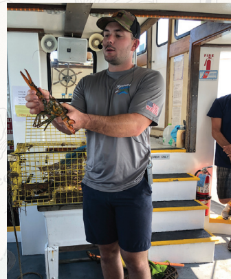
Lobster Tales Cruise

see and will answer any of your questions about the whales, birds, fish and lighthouses. OR You may choose to stay on dry land and enjoy a Dune Tour excursion. You will ride along the shoreline of the protected lands of the Cape Cod National Seashore in Suburban-like vehicles. Your driver/guide will point out the "dune shacks" where famous artists and writers became inspired to create their art. After a great afternoon exploring either land or sea and enjoying dinner together, we'll travel back to our wonderful resort on the Cape.