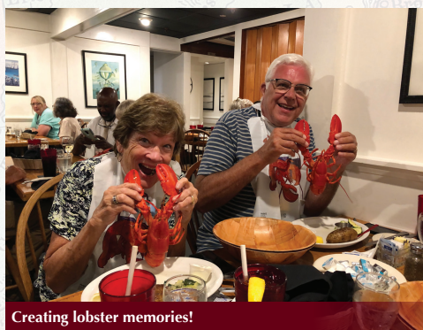
Creating lobster memories!