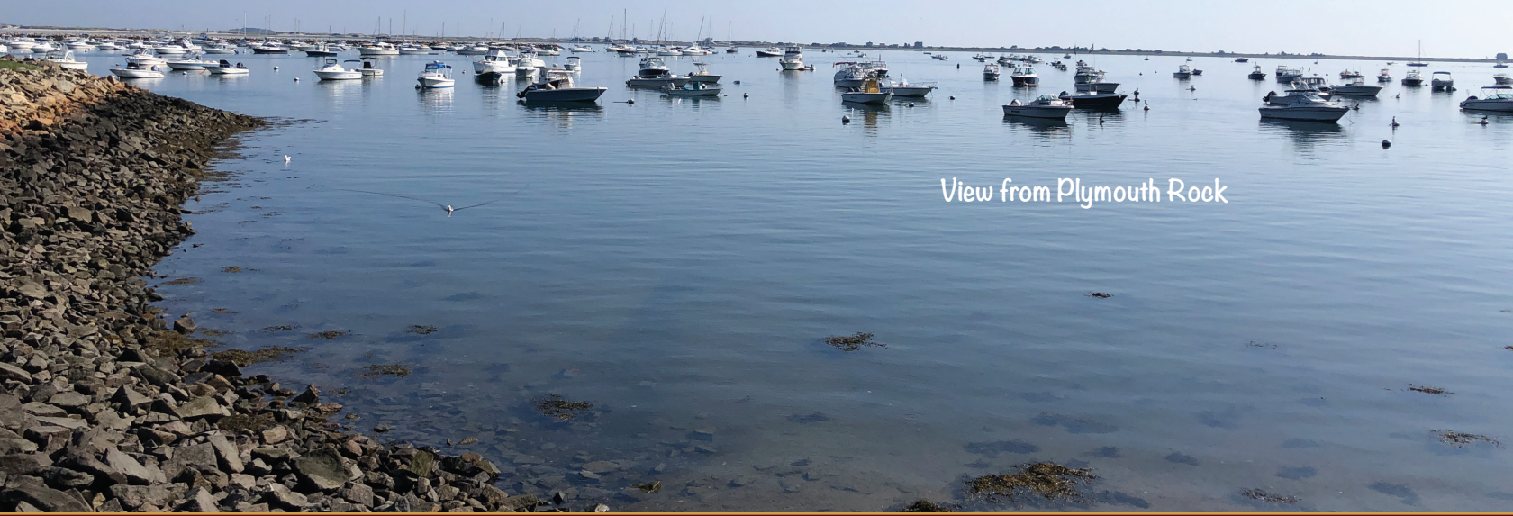
View from Plymouth Rock