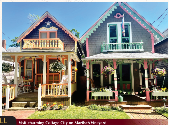
Visit charming Cottage City on Martha's Vineyard