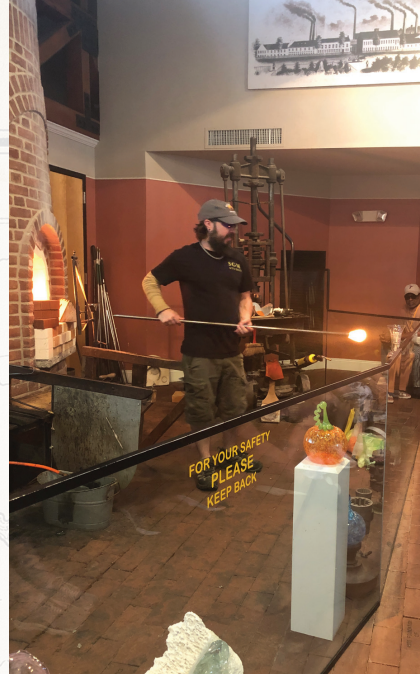
Sandwich Glass Museum