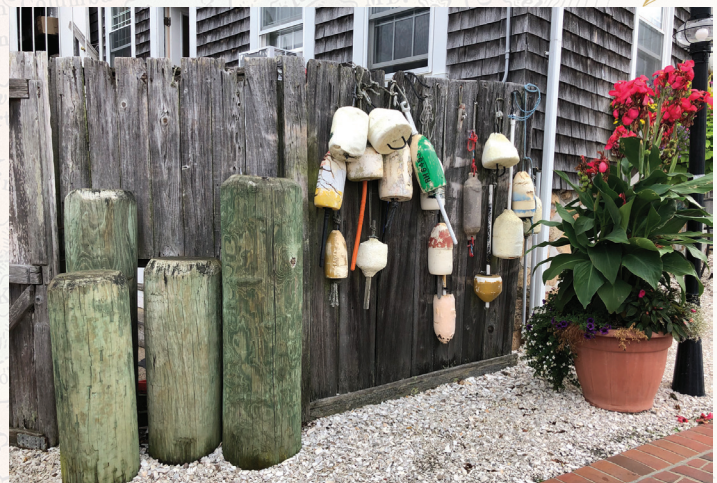
Awe the maritime magic of Martha's Vineyard!