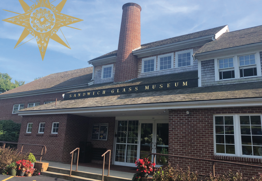
Sandwich is Cape's oldest town. The town motto is translated "after so many shipwrecks, a haven"