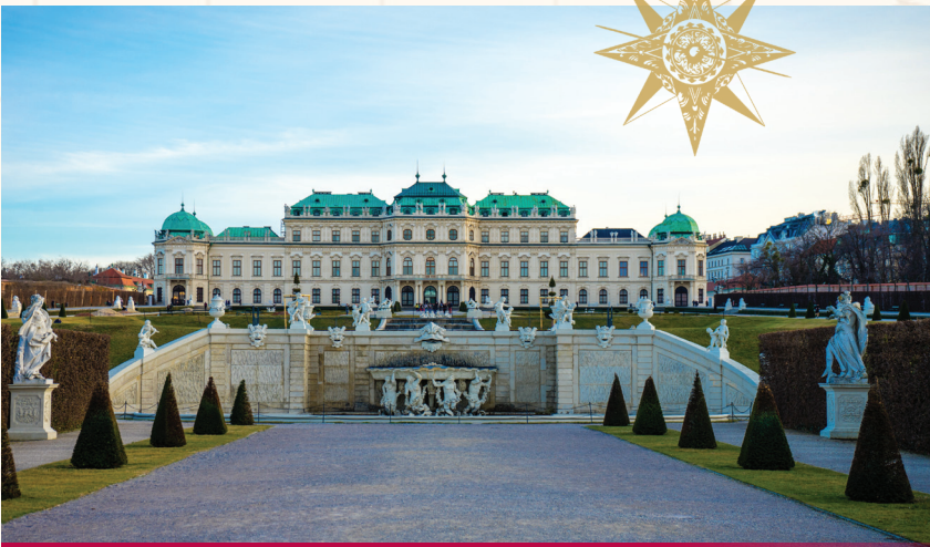
Belvedere Palace - Vienna, Austria