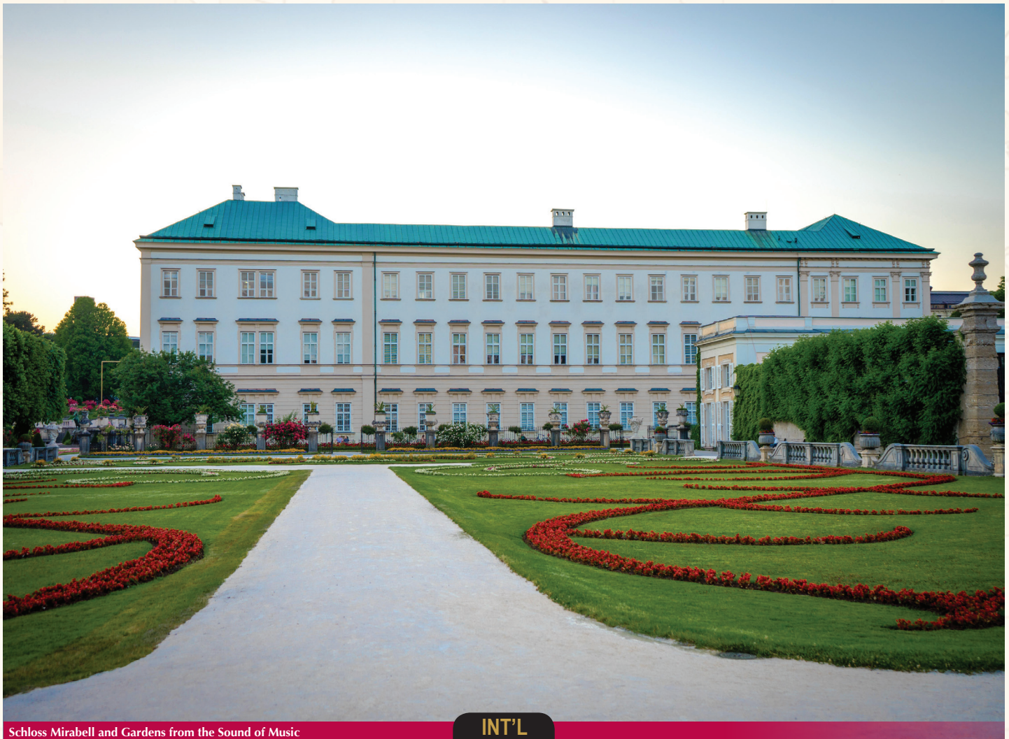
Schloss Mirabell and Gardens from the Sound of Music

a stop at the Mirabell Gardens, created in the beginning of the 18th Century. Admire the many statues, the pools adorned with sculptures and flowers, and the beautiful rose gardens. We'll proceed on walking tour to the romantic Old Town nestled between the left bank of the Salzach River and the town's huge Moenchsberg (Monk's Hill). We'll stroll along Getreidegasse and visit Mozart's house. Here we will see his original musical instruments and manuscripts. Continue along picturesque Getreidegasse, with its wrought iron signs, and arrive at the great Festival Hall. Our next stop will