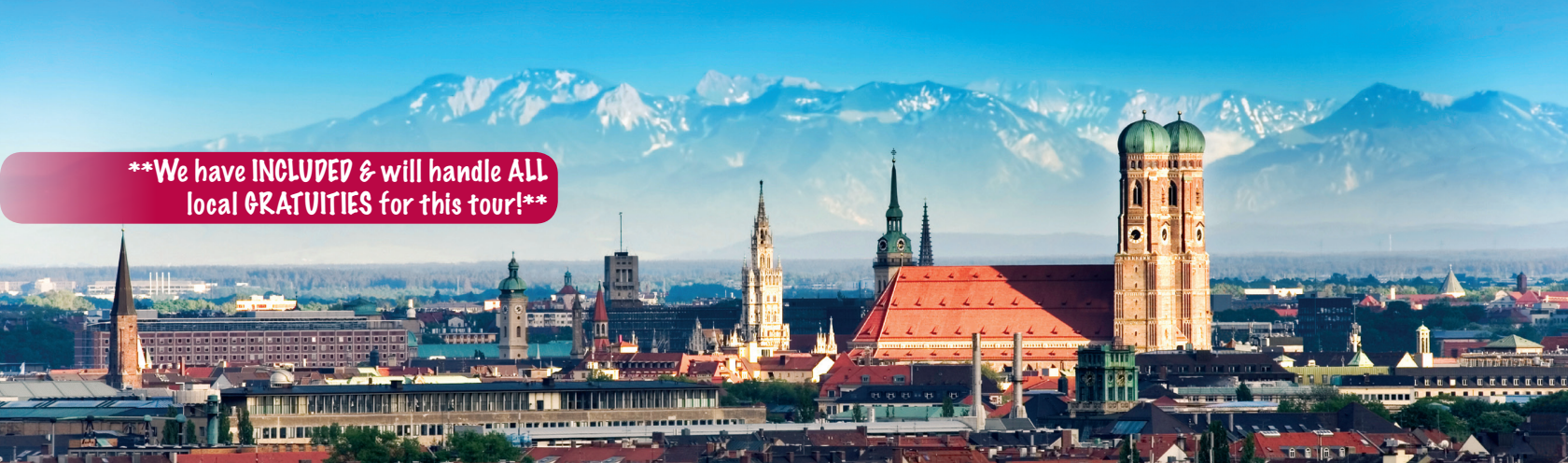
Charming city of Munich

**We have INCLUDED & will handle ALL local GRATUITIES for this tour!**