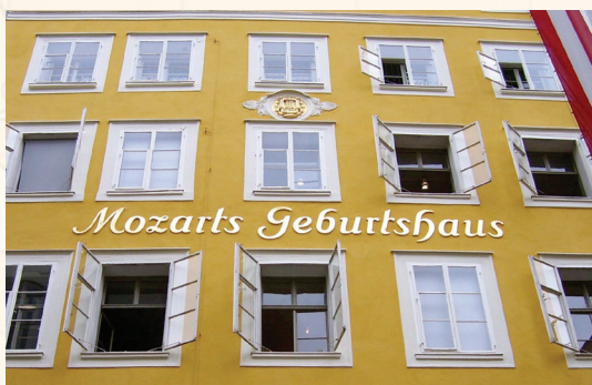
Mozart's Birth home