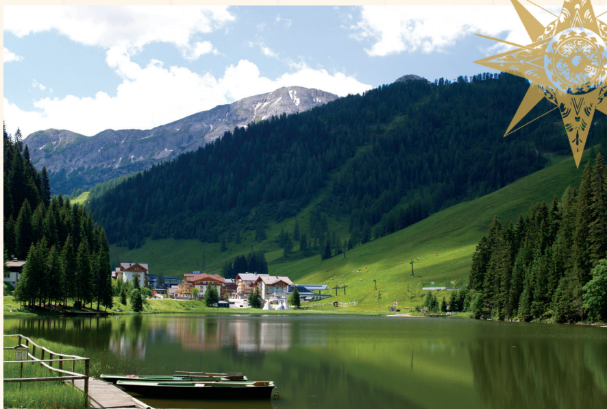
Scenic Austrian countryside

be the Cathedral, with the biggest organ in Austria. Across Cathedral Square is the Residence, built between 1596 and 1619. After sometime to freshen up we will embark on a fun filled evening as we tour the Stiegl-Brauwelt Brewery. Learn about the largest private brewery in Salzburg that began in 1492 and enjoy Austria delicacies for our evening meal.