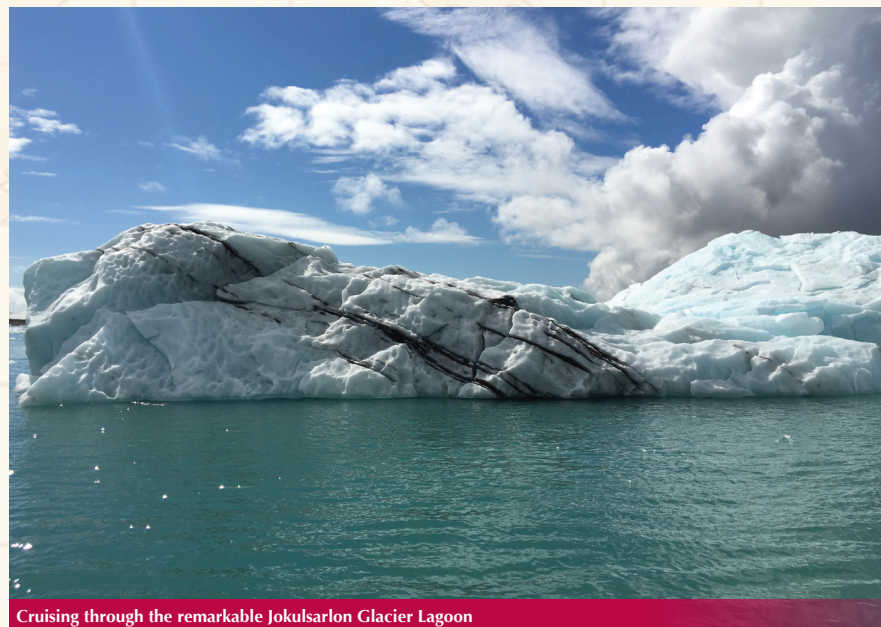
Cruising through the remarkable Jokulsarlon Glacier Lagoon

Fun Facts: Iceland has the most active volcano area in the world, the largest waterfall and glacier in Europe, and the cleanest capital in the world. Soccer is Iceland's favorite team game and in the phone book everyone is listed by their first name.