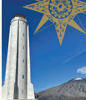
Malarriif Lighthouse - Snaefellsjokull NP