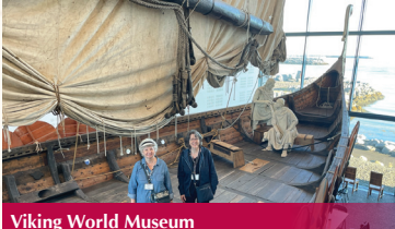
Viking World Museum