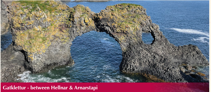
Gatklettur - between Hellnar & Arnarslapi