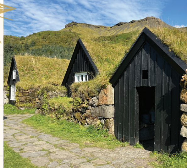
Skogar Museum's turf buildings

lakes, salmon rivers, lush valleys, unique harbors in charming fishing villages, and a world-renowned glacier. We'll look at stunning rock formations and teeming bird life in the lovely towns of the peninsula. Experience all the beauty with the serene and majestic Snaefellsjokull glacier serving as stunning backdrop. We'll also visit the Bjarnarhofn Shark Museum, where we'll get the opportunity to taste rotted shark, and learn why it is considered a delicacy in Iceland!