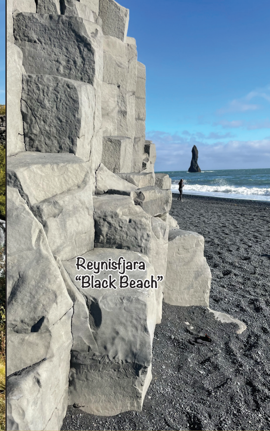
Reynisfjara "Black Beach"