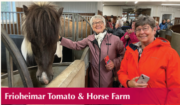
Frioheimar Tomato & Horse Farm