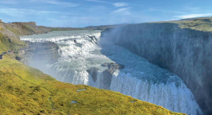
Breathtaking Gullfoss Waterfall