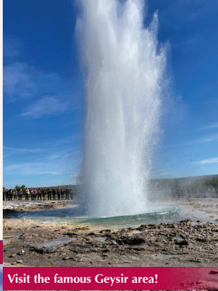
Visit the famous Geysir area!

surrounding area as you dine. The Perlan building is also home to their own Museum & Planetarium where we might get a chance to see their Northern Lights show! This afternoon you'll have some free time to explore at Reykjavik Center or relax at the hotel. Dinner and the evening are yours to explore.