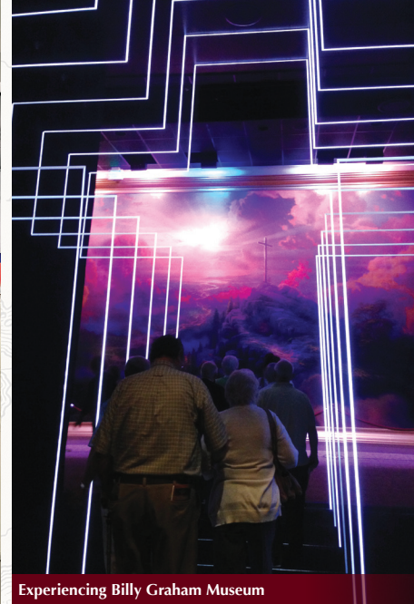
Experiencing Billy Graham Museum