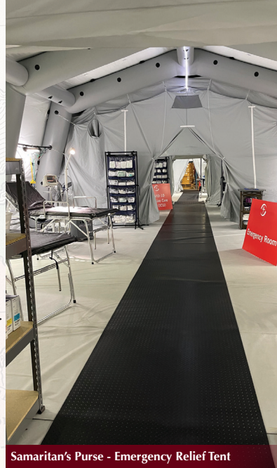
Samaritan's Purse - Emergency Relief Tent