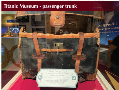
Titanic Museum - passenger trunk