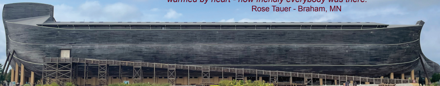
Ark Encounter - at 510 feet long, 85 feet wide, and 51 feet high, the Ark is impressive!