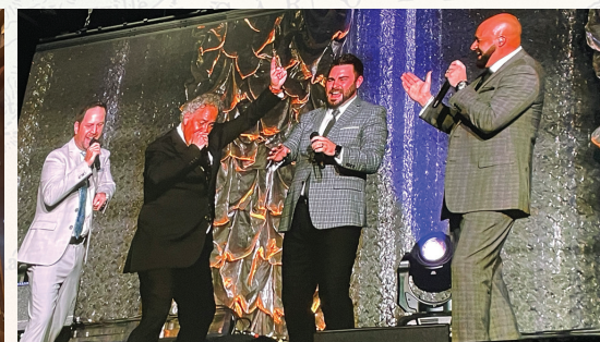
National Quartet Convention - such talent!