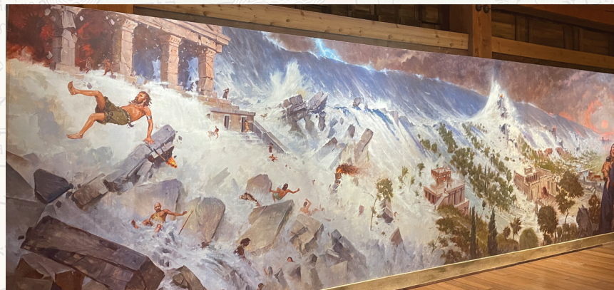
Mural at the Ark Encounter!