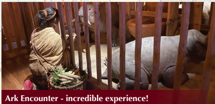
Ark Encounter - incredible experience!