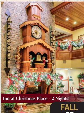
Inn at Christmas Place - 2 Nights!