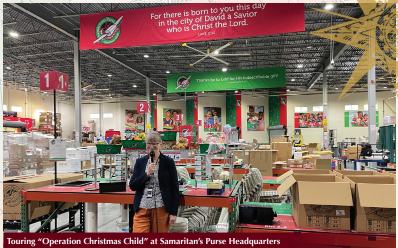
Touring "Operation Christmas Child" at Samaritan's Purse Headquarters