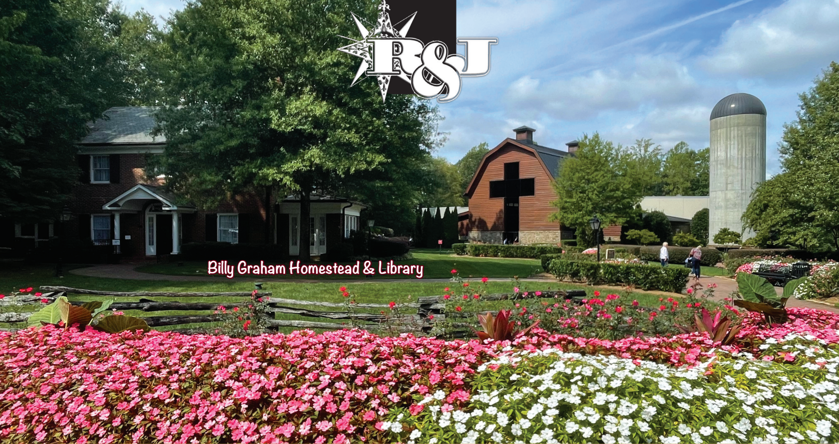
Billy Graham Homestead & Library