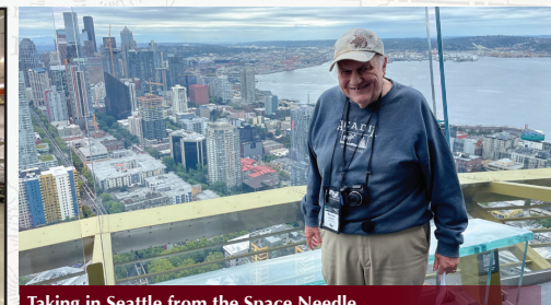
Taking in Seattle from the Space Needle

Mount Rainier National Park - breathtaking!