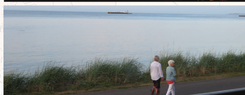
Evening stroll at the Red Lion Hotel