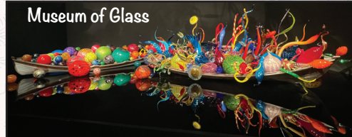
Museum of Glass