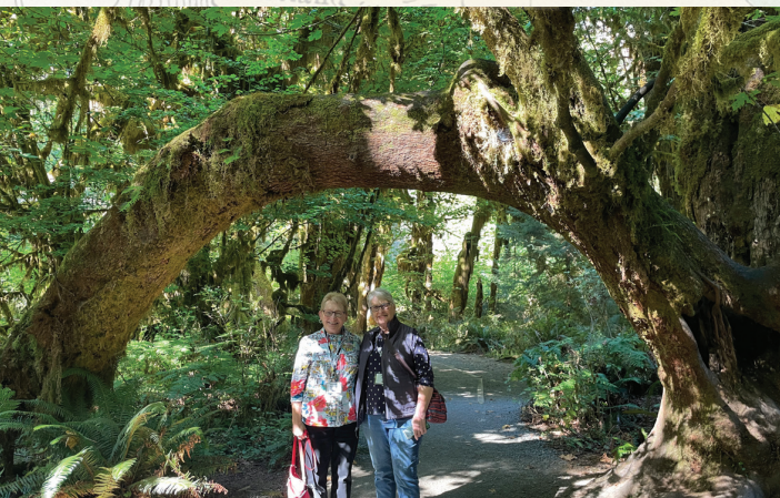
Hoh Rainforest - Olympic National Park