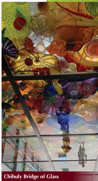
Chihuly Bridge of Glass