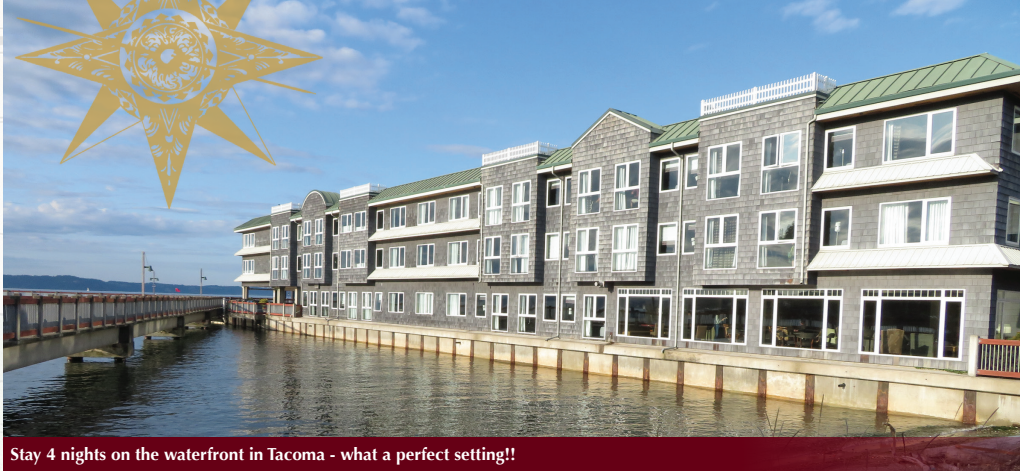
Stay 4 nights on the waterfront in Tacoma - what a perfect setting!!