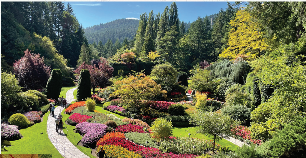
Butchart Gardens in Victoria is stunning!