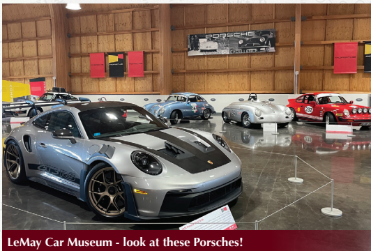
LeMay Car Museum - look at these Porsches!