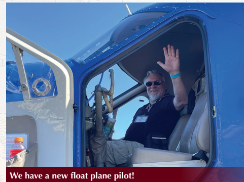
We have a new float plane pilot!