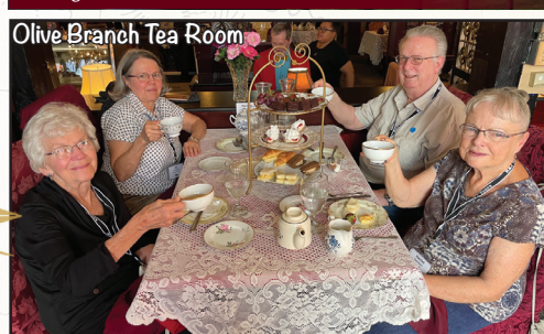
Olive Branch Tea Room