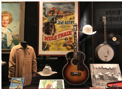
National Cowboy & Western Heritage Museum

After breakfast at the hotel, we will depart for the Oklahoma City National Memorial, a memorial that honors the victims, survivors, rescuers, and all who were affected by the Oklahoma City bombing on April 19, 1995. After visiting the memorial we will visit The Memorial Museum, which is an interactive learning experience that