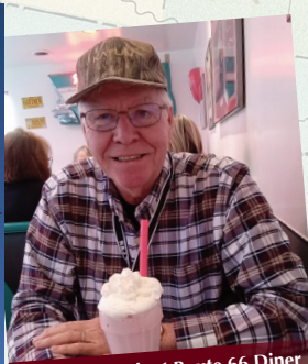
Nostalgic lunch at Route 66 Diner