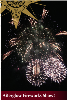
Afterglow Fireworks Show!