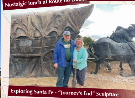
Exploring Santa Fe - "Journey's End" Sculpture