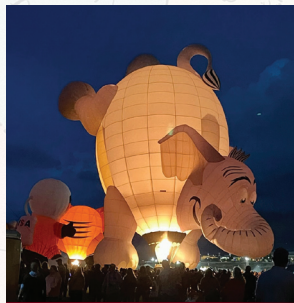
Glowdeo - spectacular!