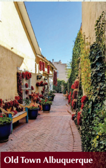
Old Town Albuquerque