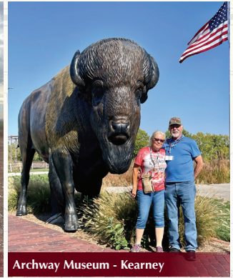
Archway Museum - Kearney

the evening session. We have reservations at the Gondola Club for a once in a lifetime evening with an included dinner buffet. This reserved area gets you away from the crowds with private seating outdoors, delicious food and luxury bathrooms just for Gondola Club members. Just imagine being able to have a private seat complete with wonderful food while looking out over tonight's featured Special Shapes Glowdeo. Fiesta Glow is when all the balloons fire their burners and light up at the same time! This is perhaps the most spectacular single moment in all of Balloon Fiesta, plus it's followed by New Mexico's most spectacular Afterglow Fireworks Show!