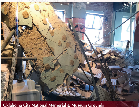
Oklahoma City National Memorial & Museum Grounds

takes you on a chronological self-guided tour through the story of April 19, 1995, and the days, weeks and years that followed the bombing of Oklahoma City's Alfred P. Murrah Federal Building. The story tracks the remarkable journey of loss, resilience, justice and hope. After leaving Oklahoma City we will stop in Shamrock, Texas for a delicious lunch and then make a visit to the Groom Cross, a 19-story cross located next to Interstate 40. This 190-foot-tall, free-standing cross can be seen from 20 miles away. Surrounding the base of the cross are life-sized statues of the 14 Stations of the Cross. Our journey will then continue on to Amarillo, TX where we will spend the night. Enjoy the Drury's "Kickback" Reception.