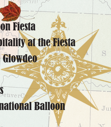
Albuquerque Balloon Museum