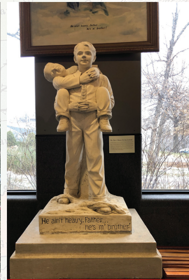
Boys Town will be touching!