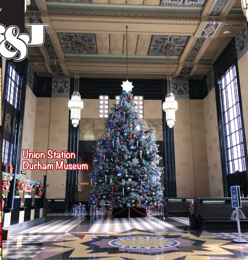
Union Station Durham Museum