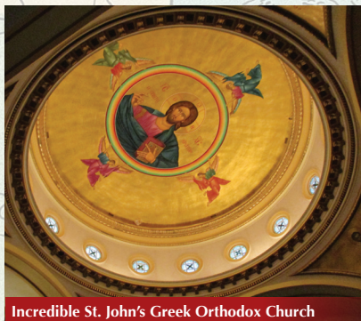
Incredible St. John's Greek Orthodox Church