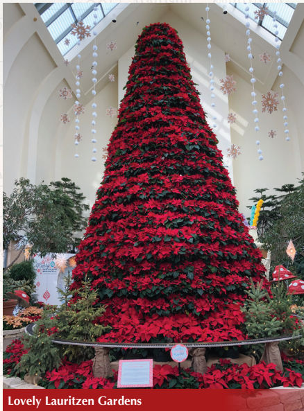
Lovely Lauritzen Gardens