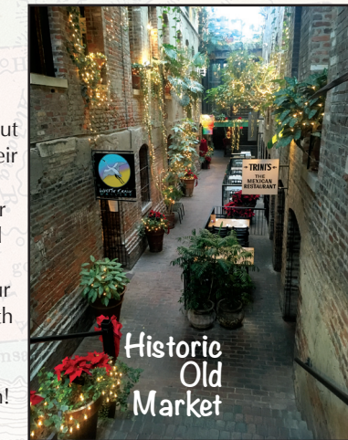
Historic Old Market