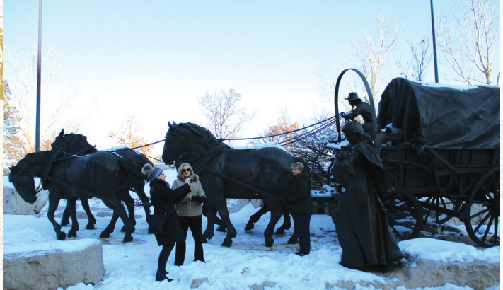
Pioneer Courage Park