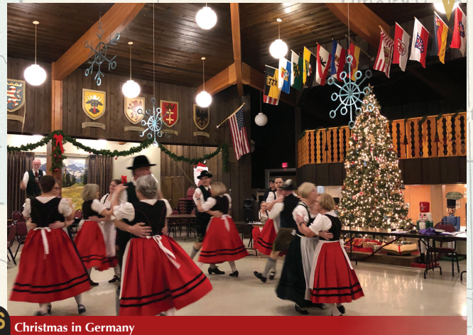
Christmas in Germany