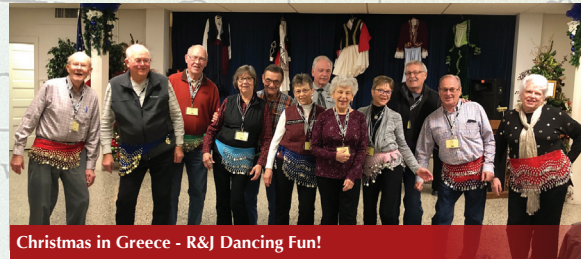
Christmas in Greece - R&J Dancing Fun!