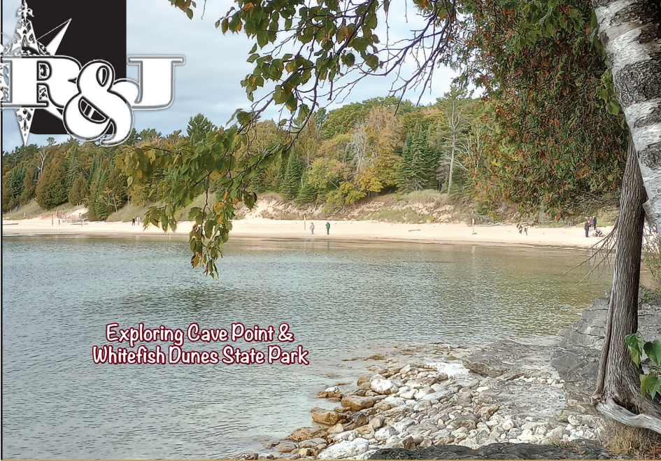
Exploring Cave Point & Whitefish Dunes State Park