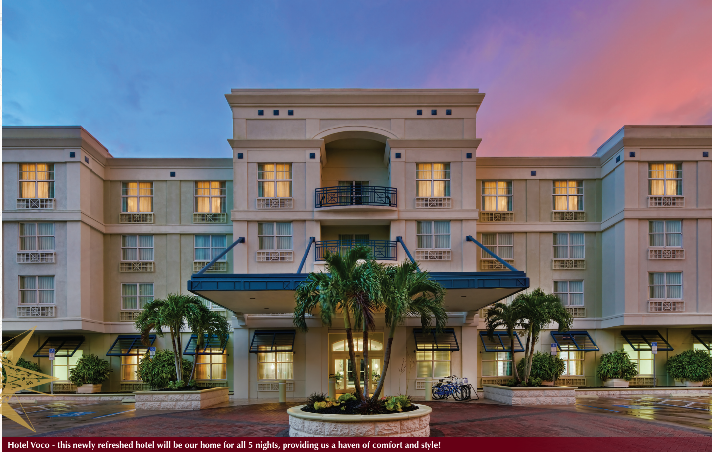
Hotel Voco - this newly refreshed hotel will be our home for all 5 nights, providing us a haven of comfort and style!

meo, Edsel, and muscle cars. Next we head to Bradenton to spend time at the Red Barn, featuring both open-air and indoor flea market booths waiting to be explored. It will be easy to find something for lunch on your own at the Red Barn, perhaps to enjoy while you take in their entertainment. Early this afternoon we'll visit The Bishop Museum of Science & Nature. Our guided tour will bring The Bishop's collections and exhibitions to life and provide an opportunity to look deeper into Florida's natural history. While here, we'll also experience their state-of-the-art Planetarium show as well as their world-renowned Parker Manatee Rehabilitation Habitat. Afterwards, we're guests at Rosa Fiorelli Winery for the evening. After tasting six of their signature wines on the outdoor patio, we'll tour the vineyard and production facility before heading back to the outdoor patio for a delicious lasagna buffet!