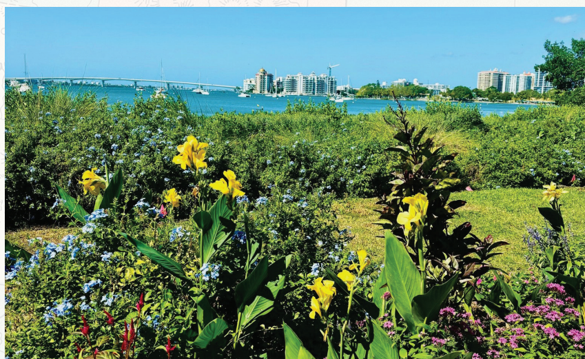
Marie Selby Botanical Gardens on Sarasota Bay