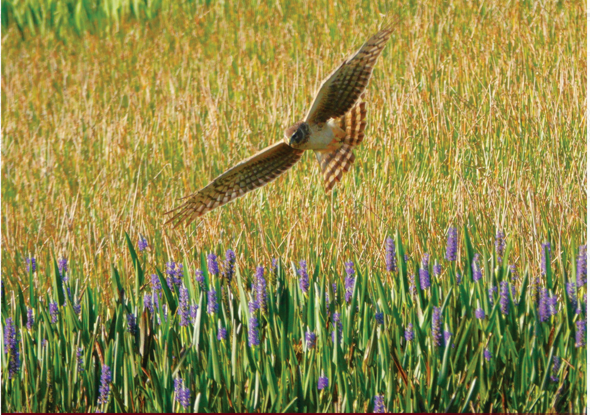
Sarasota Audubon - a Northern Harrier flying in over the marsh's Pickerel Weed

Nearly 100 years ago, John Ringling, the legendary circus king, pledged, "I am going to make Sarasota one of the sights of the South... [it] will become one of the most beautiful cities in Florida." Join us as we experience Sarasota - we feel John lived up to his pledge!