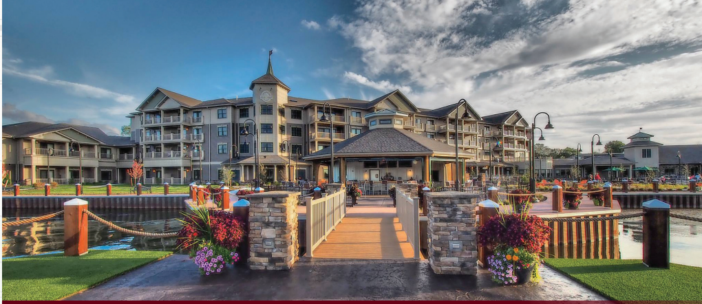
Stay 2 nights on Chautauqua Lake in waterfront rooms!