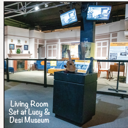
Living Room Set at Lucy & Desi Museum