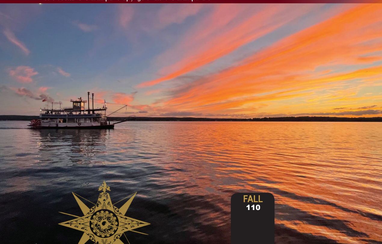
Authentic Steamer Chautauqua Belle plying the water of Chautauqua Lake

A hearty breakfast at the hotel will prepared us for a full day of exploring this magnificent and industrious area. First we'll head to the Niagara Parks Power Station, the first major power plant on the Canadian side of the Niagara River. Now featuring immersive exhibits, restored artifacts, and interactive storytelling, we will