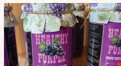
Grape Discovery Center