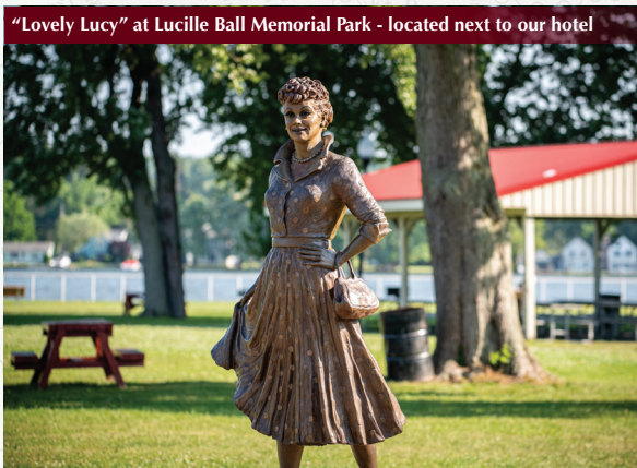
"Lovely Lucy" at Lucille Ball Memorial Park - located next to our hotel