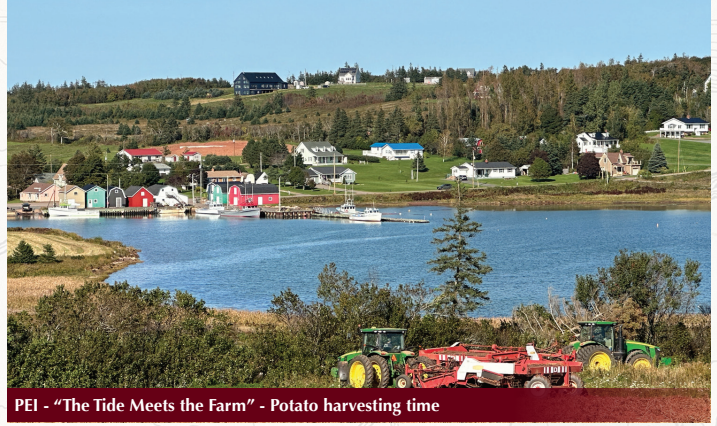
PEI - "The Tide Meets the Farm" - Potato harvesting time