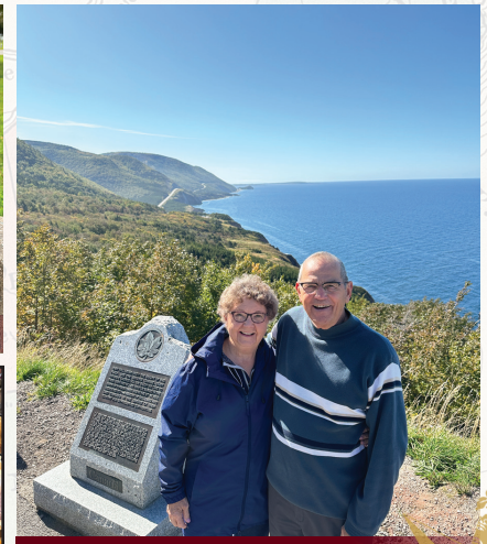
Enjoying Cabot Trail's views!