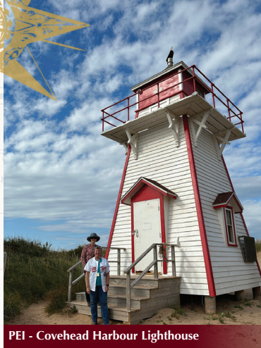
PEI - Covehead Harbour Lighthouse