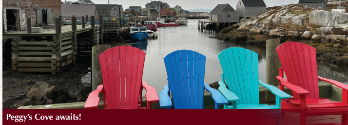
Peggy's Cove awaits!