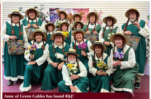
Anne of Green Gables has found R&J!