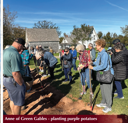
Anne of Green Gables - planting purple potatoes