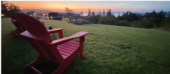
Sunset at Silver Dart Inn - take a seat!