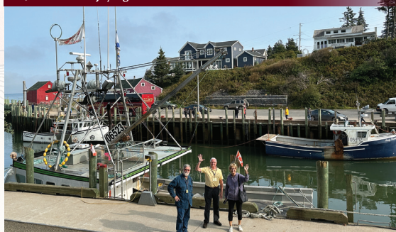
R&J Travelers enjoying Halls Harbour!