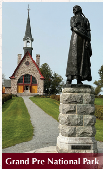
Grand Pre National Park