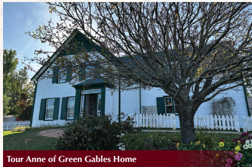
Tour Anne of Green Gables Home