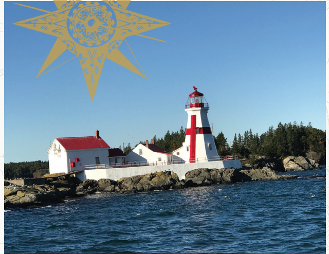
Head Harbour Lightstation near Campobello Island

at Pleasant Bay along the beautiful Cabot Trail before we continue exploring Cape Breton Island with many photo stops along the way. Dinner will be served at the Inn tonight.