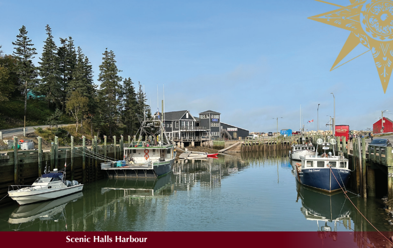
Scenic Halls Harbour