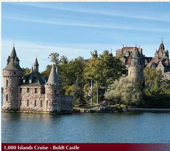
1,000 Islands Cruise - Boldt Castle