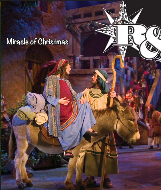
Miracle of Christmas