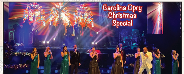
Carolina Opry Christmas Special