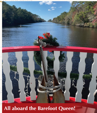
All aboard the Barefoot Queen!