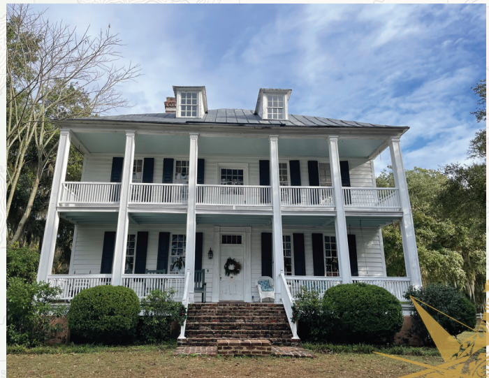
A special visit to Hopsewee Plantation is planned!