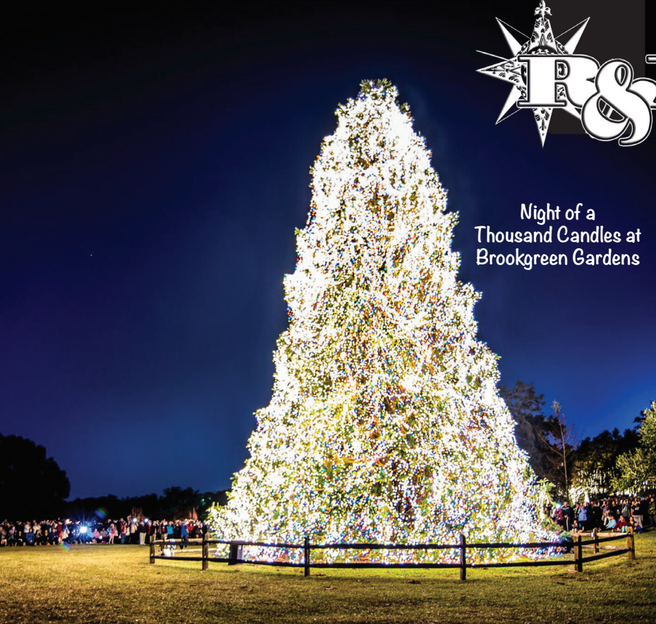
Night of a Thousand Candles at Brookgreen Gardens