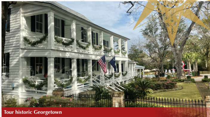
Tour historic Georgetown