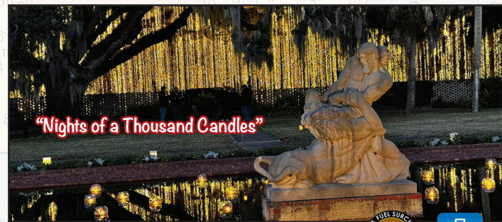
"Nights of a Thousand Candles"