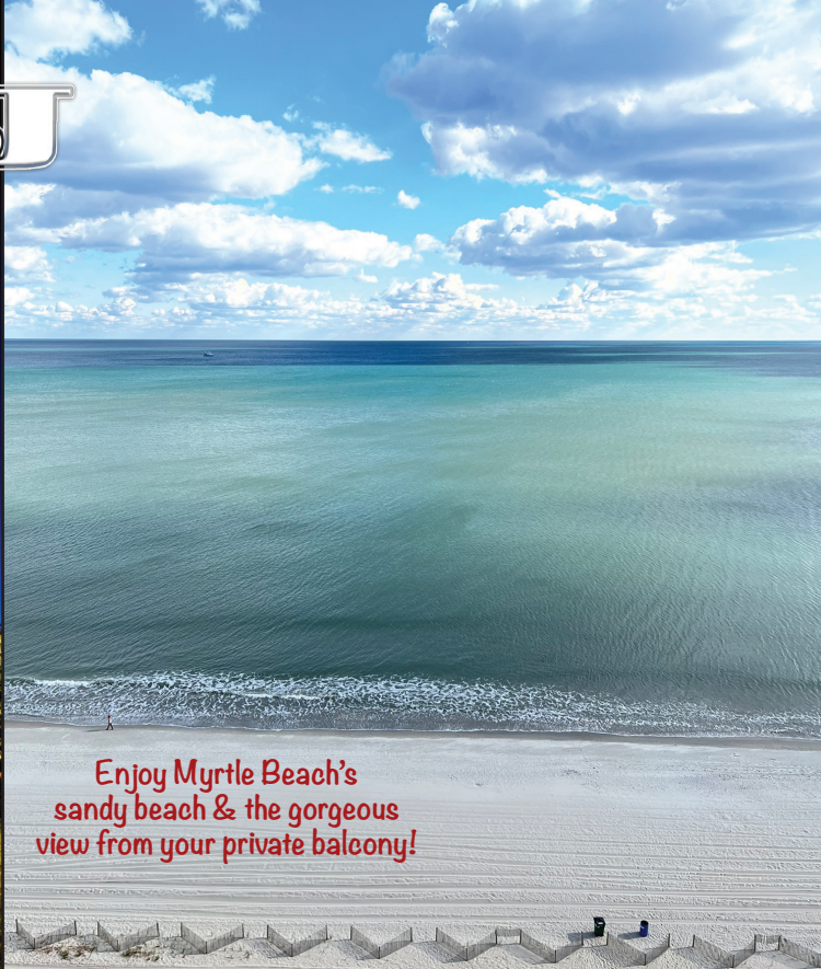
Enjoy Myrtle Beach's sandy beach & the gorgeous view from your private balcony!