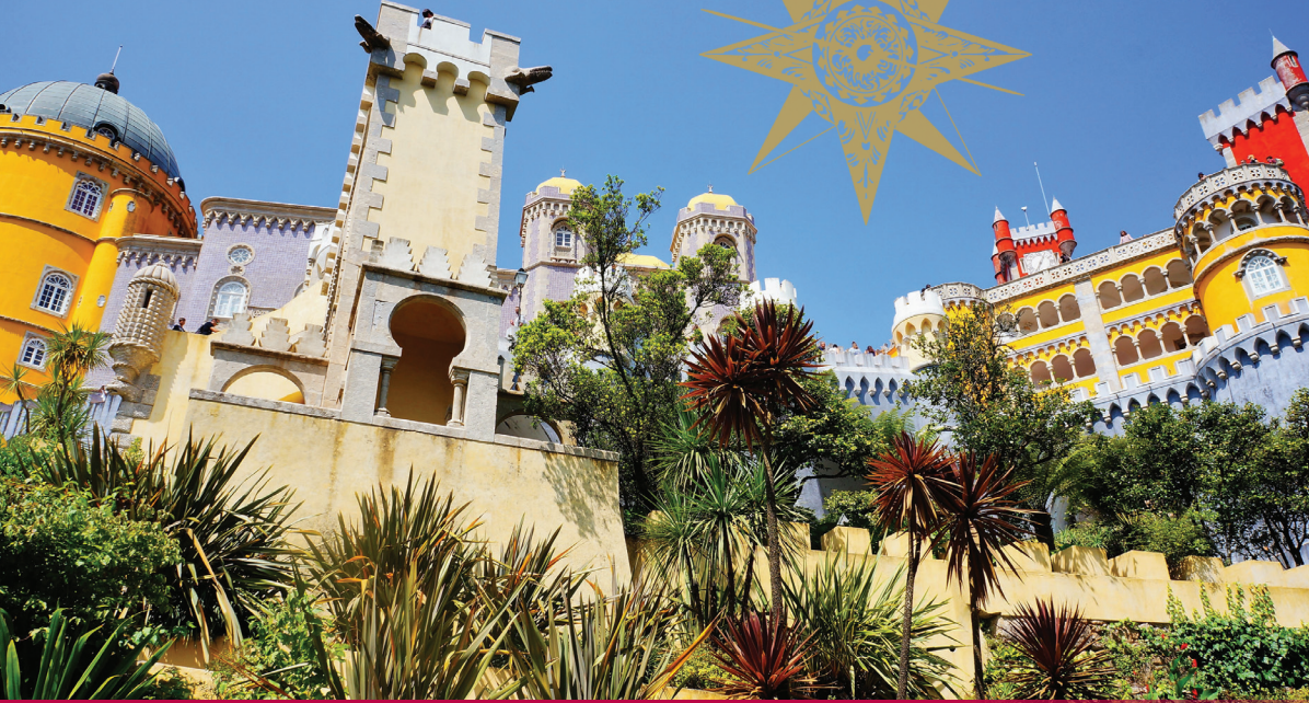
Just wait until you see the colorful and massive National Palace of Pena in Sintra