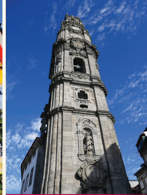
Porto - Clerigos Tower

introduces us to the University of Coimbra, built on the grounds of a former palace and famed for its baroque library, the Biblioteca Joanina. Here we will also find the Royal Palace. Having been built at the end of the 10th century, it is rich in history. Our day concludes with a delectable three-course dinner before we settle into the comfort of Coimbra Aeminium, our 4-star accommodation.