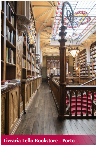
Livraria Lello Bookstore - Porto

Hotel: Madalena by The Beautique Hotels (3 Nights)