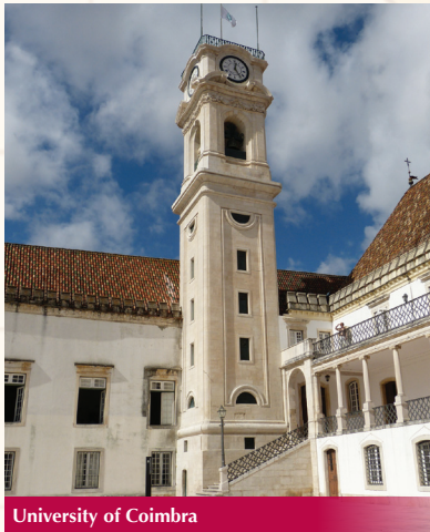
University of Coimbra