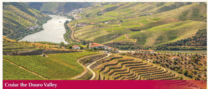
Cruise the Douro Valley